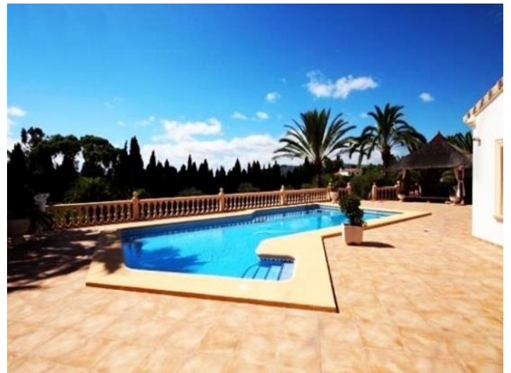
Beautiful terrace with spacious pool