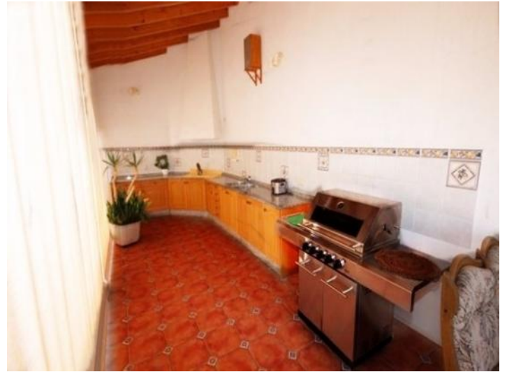
Spectacular outdoor kitchen