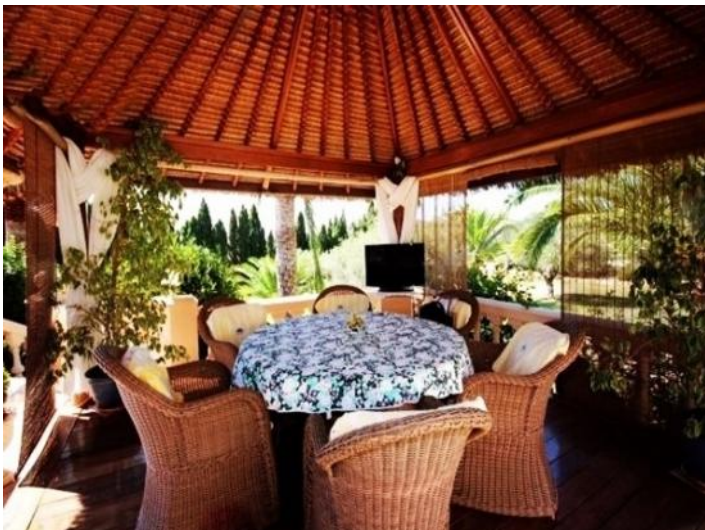
The unique honeymoon pavillon that offers the perfect place