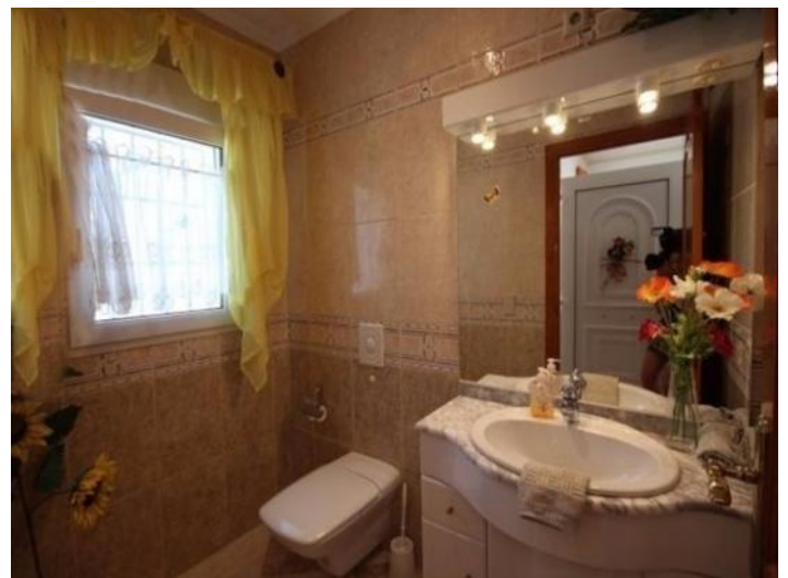
One of the great bathrooms