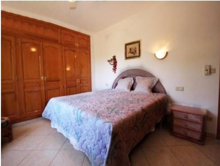
One of the stylish bedrooms