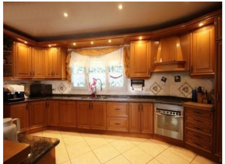
Beautiful kitchen with incredible interior