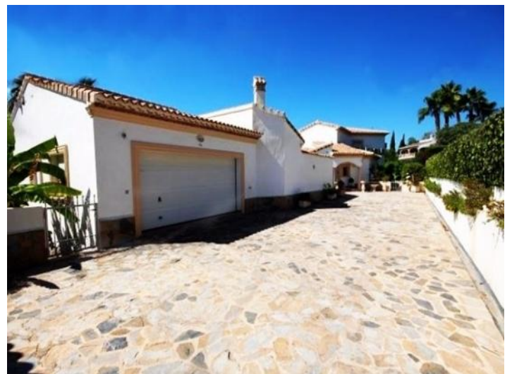
The driveway with garage