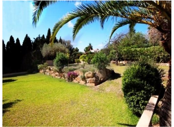
The well maintained beautiful garden