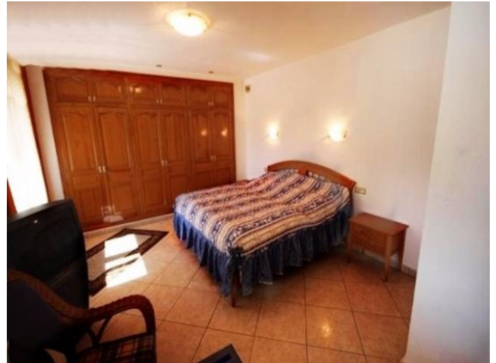
Cozy bedroom with spacious wardrobe