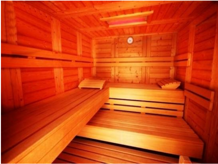
Cozy sauna with a lot of space