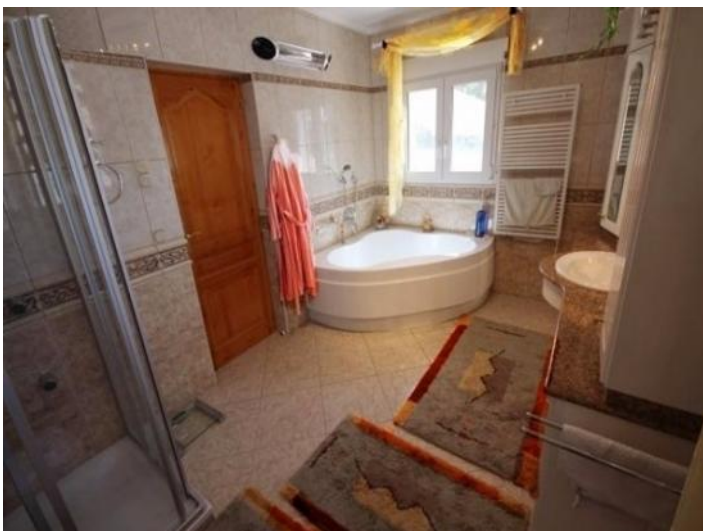
One of the great bathrooms