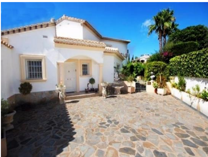
The drive way of the villa