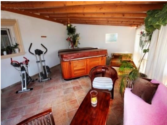
Fitnessroom with Jacuzzi