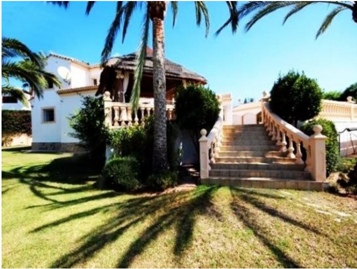
The well maintained beautiful garden