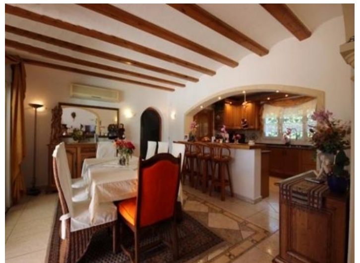
The bright, spacious living room