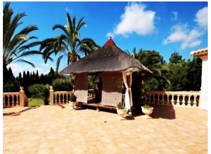
The exclusive garden with a lot of possibilities to enjoy the