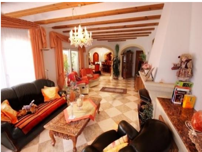
The bright, spacious living room