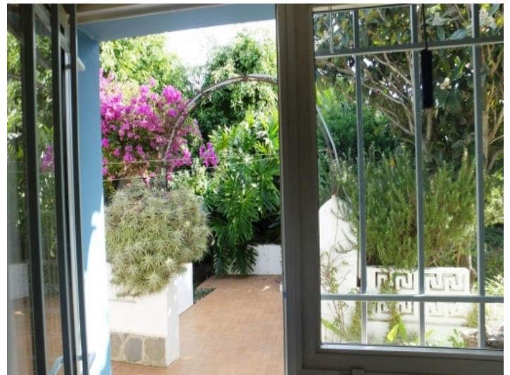
Another garden terrace