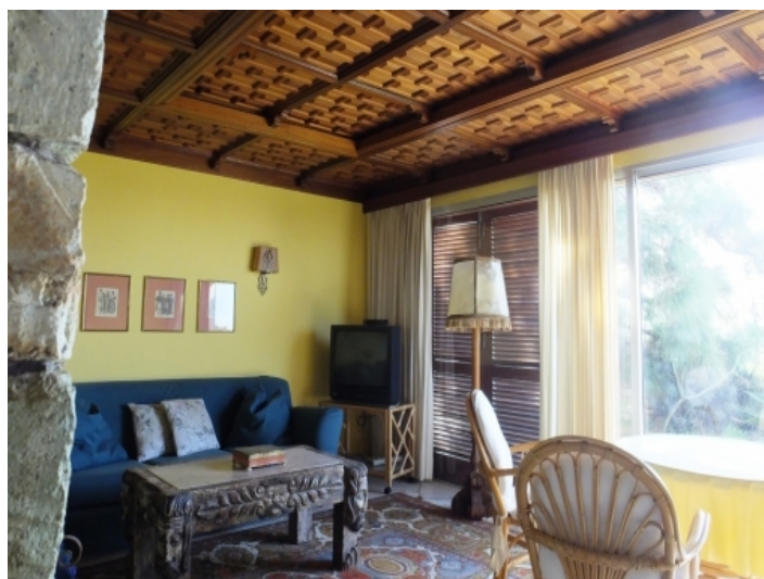
Wooden ceiling of the livingroom