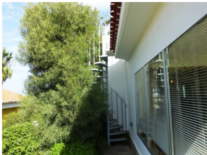
Stairway to the roof terrace