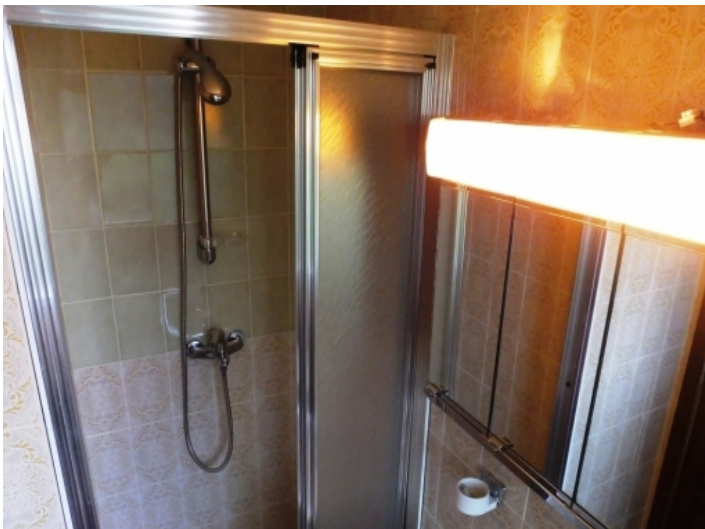
Bathroom of the separate apartment