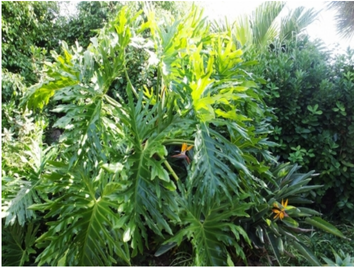
Botanic garden 2