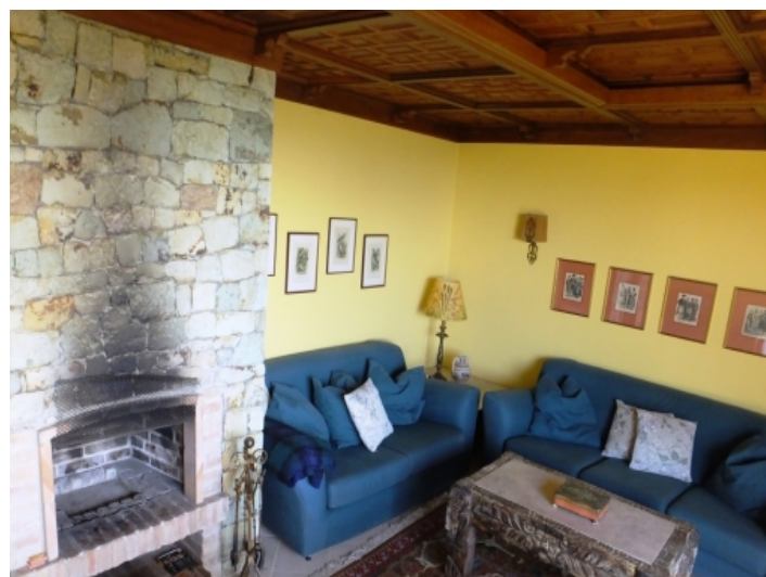
Livingroom with chimney