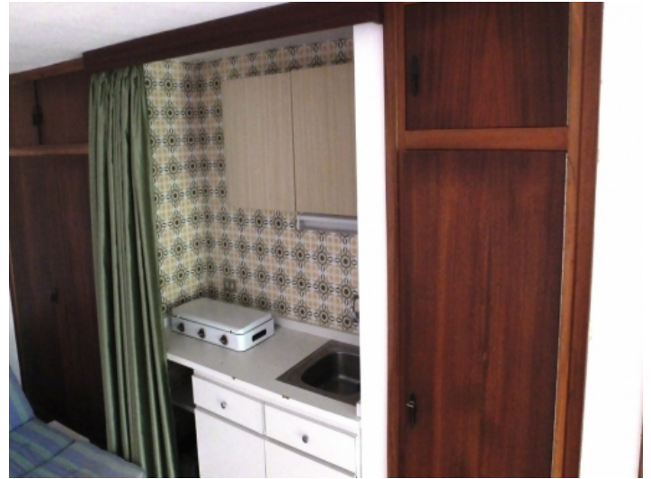
Kitchen of the separate apartment