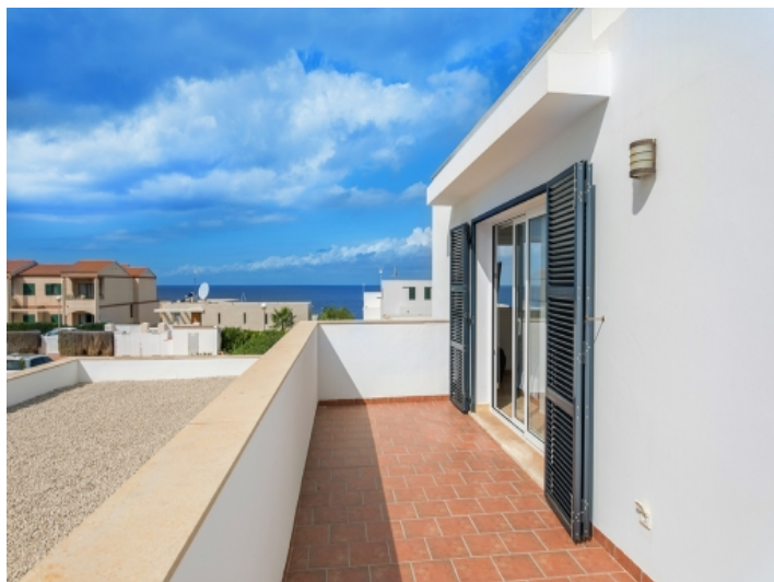
Balcony with beautiful sea views