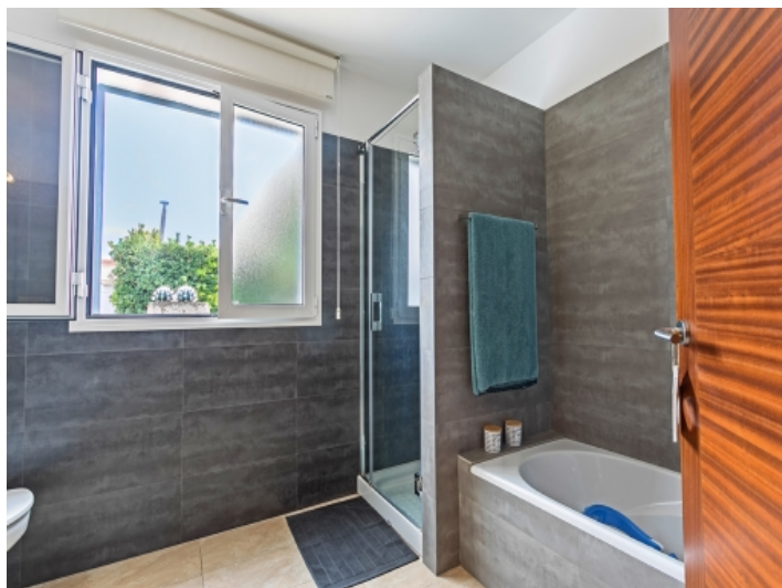
Modern bathroom with bathtub and shower