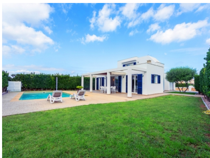
Large garden with pool