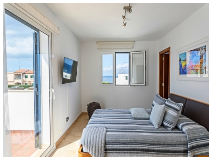
Master bedroom with balcony