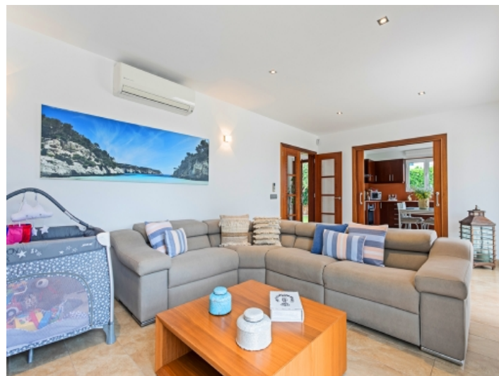
Spacious living area