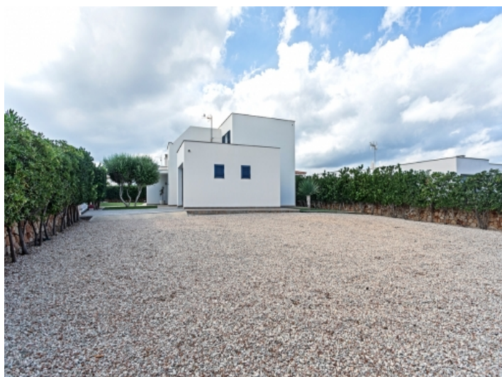
Rear view of the villa