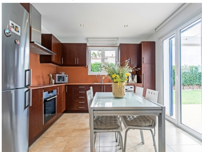
Beautiful kitchen and dining area