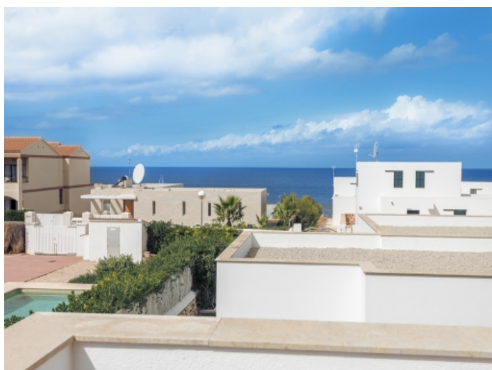
Lovely sea views