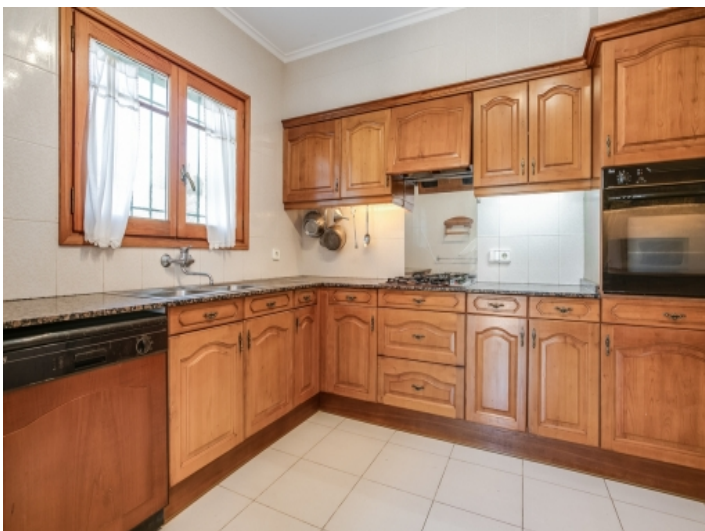
Spacious country house kitchen