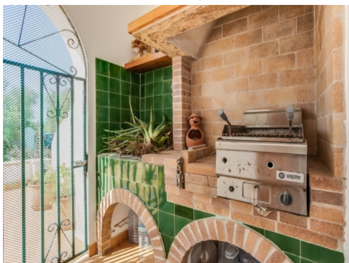
Fantastic bbq area