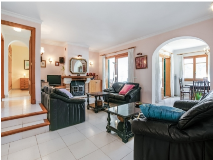
Living and dining area with terrace access