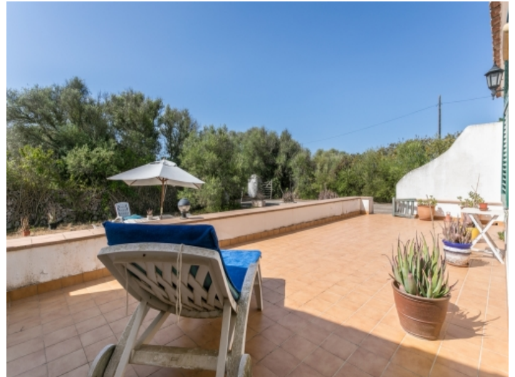
Large sun terrace