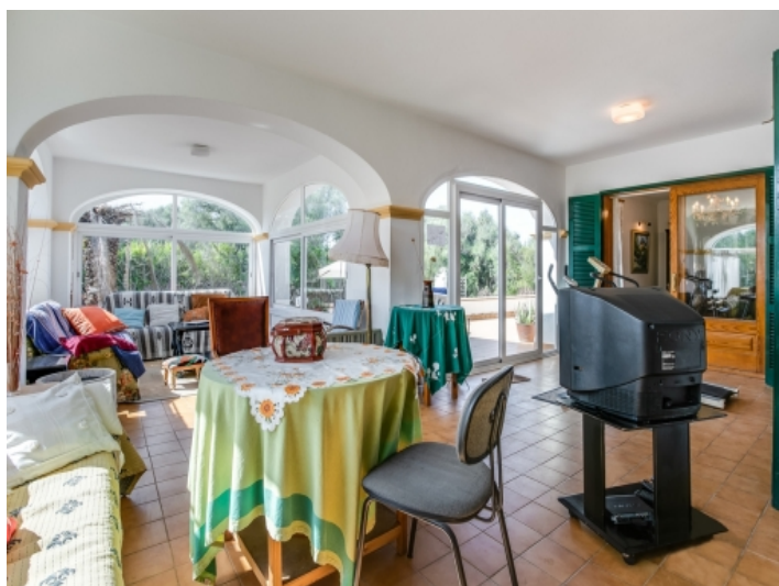
Wintergarden with ample space