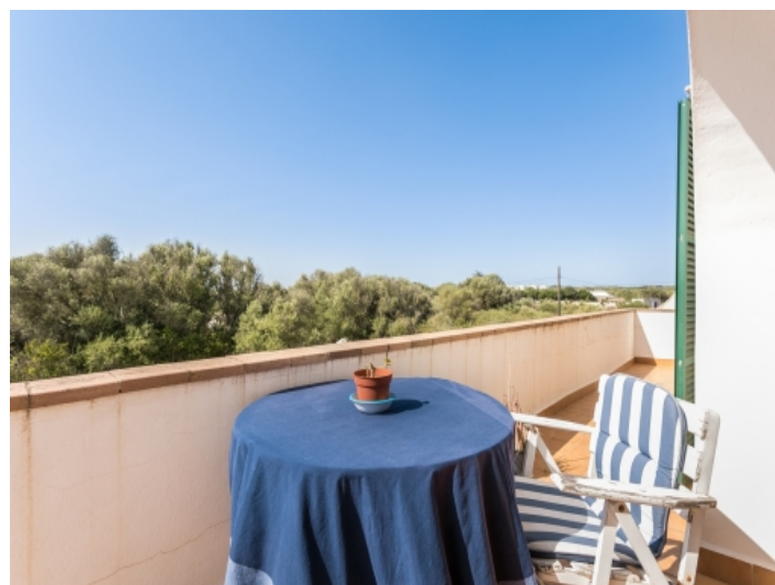
Balcony on the upper floor