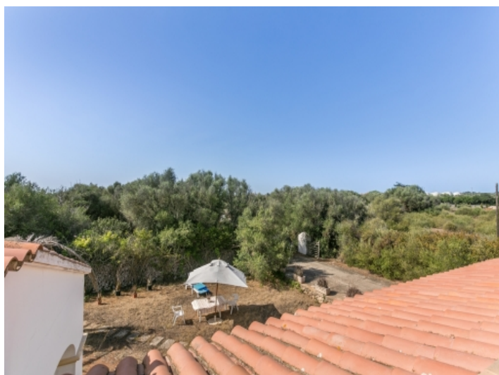
View to the plot