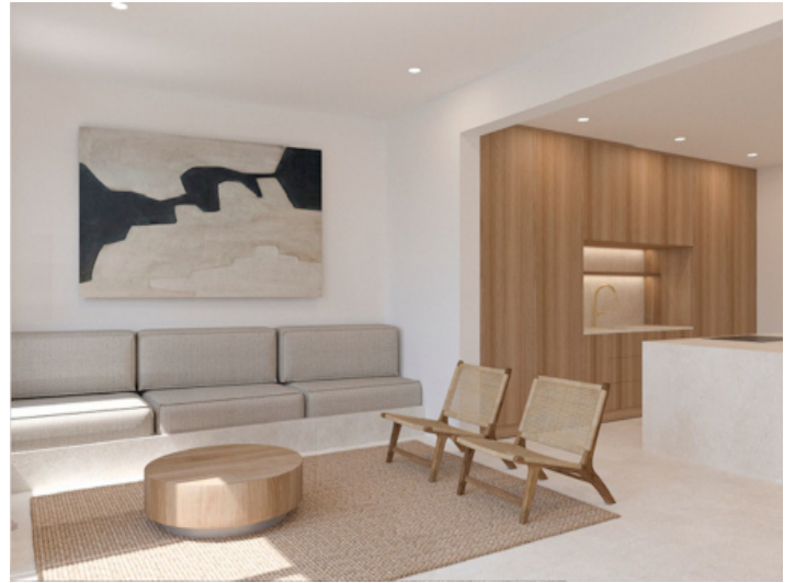
Spacious living and dining area with integrated kitchen