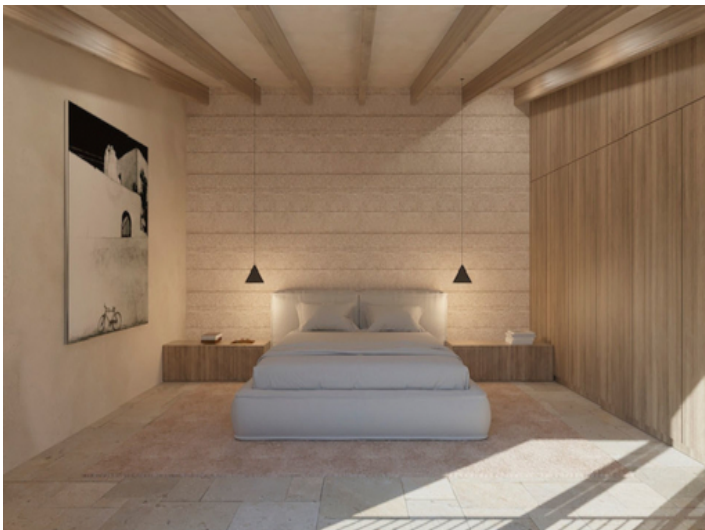
Master bedroom with en suite bathroom