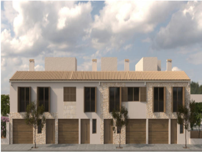
Beautiful project with all amenities next to the village center