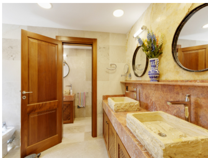
Finca with 5 bathrooms