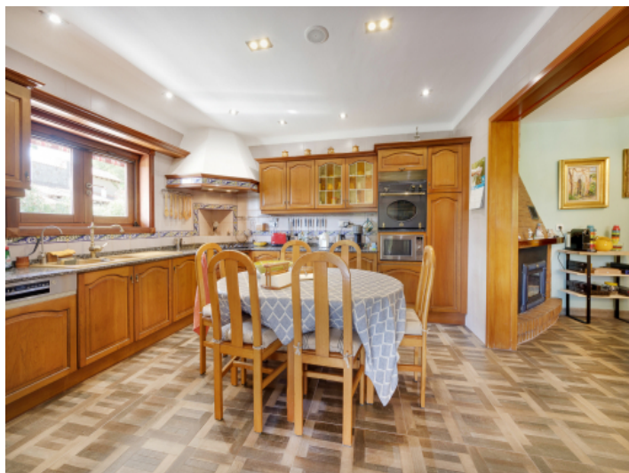
Contry style kitchen