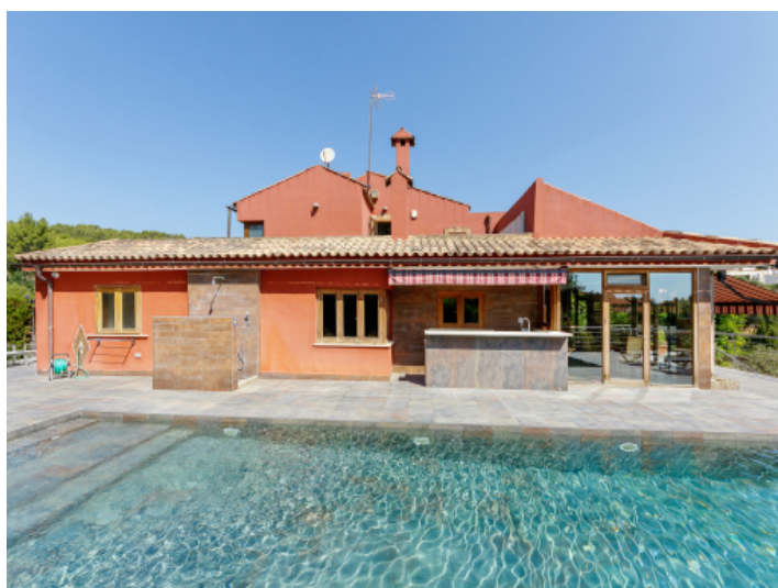
Pool and façade