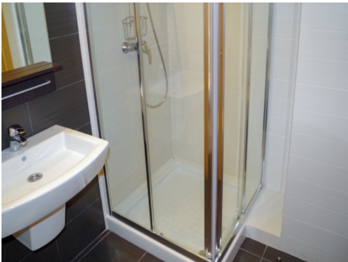
Alternative view of the bathroom