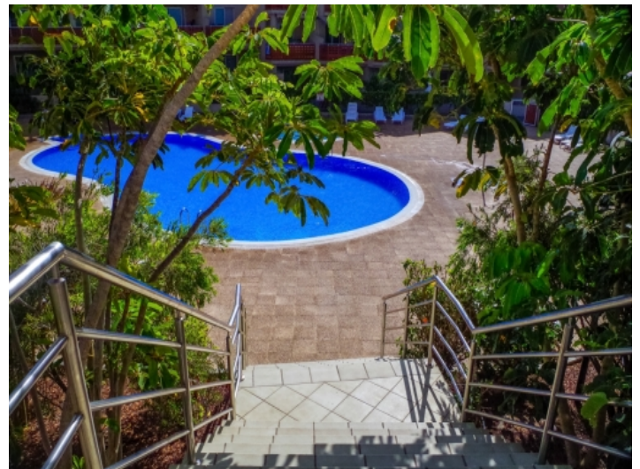
Access to the beautiful pool area