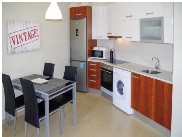
Fully equipped kitchen with dining area