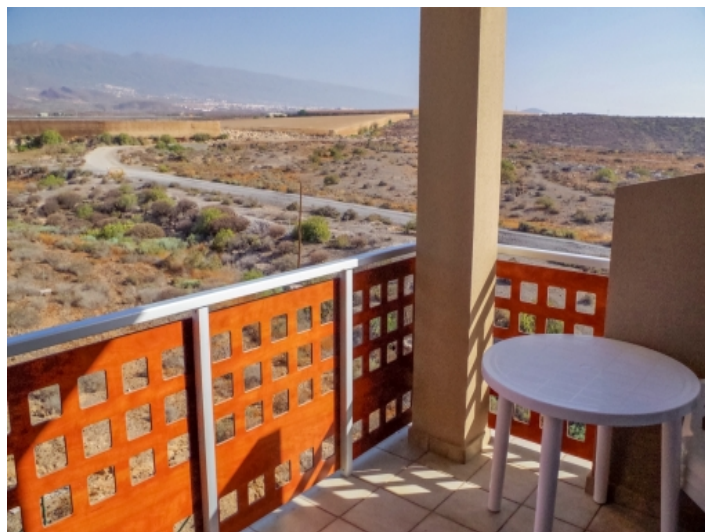
Sweeping views from the balcony