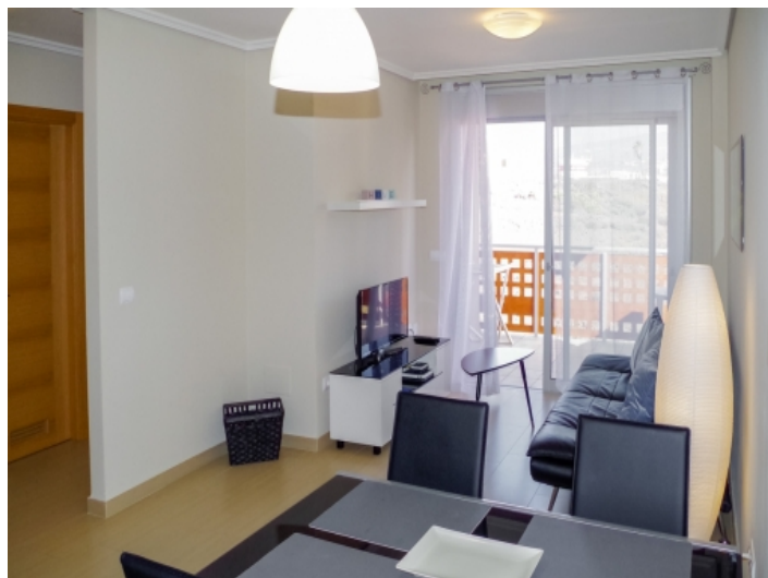
Living and dining area with balcony access