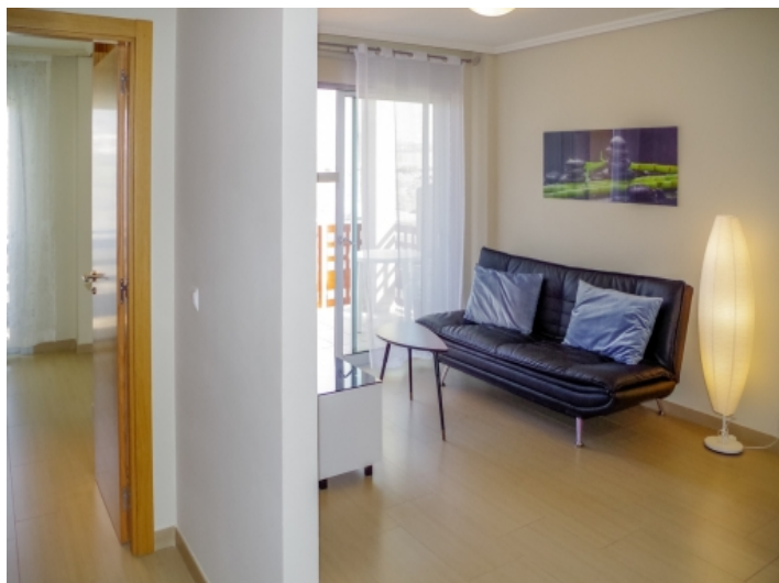
Friendly living area