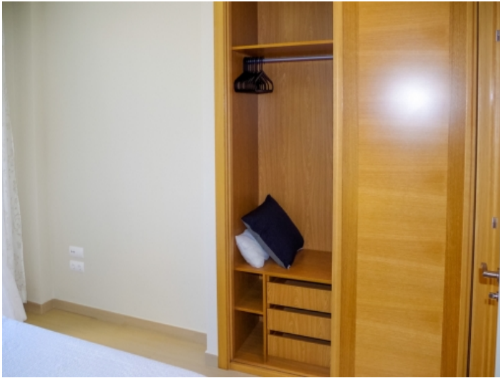
Bedroom with built-in wardrobe