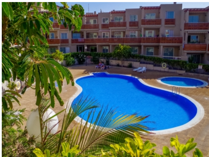
Well-tended communal pool