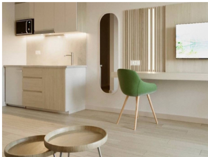
Contemporary interior design