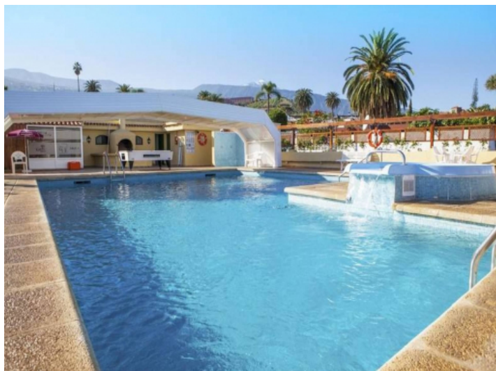
Large pool area