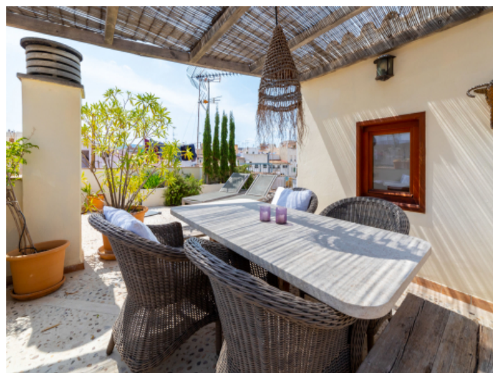
Covered outdoor dining area