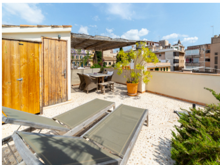
Fantastic roof terrace in the heart of Palma