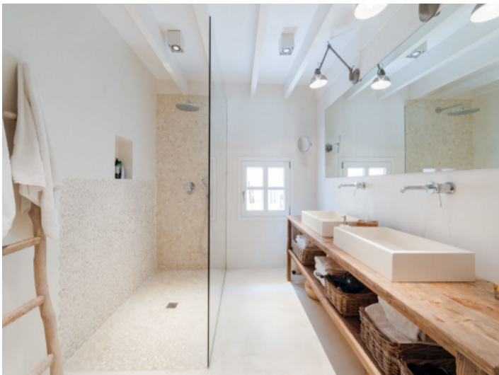
Beautifully furnished bathroom