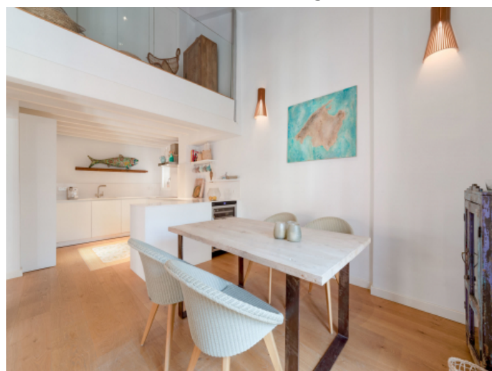
Beautiful dining area