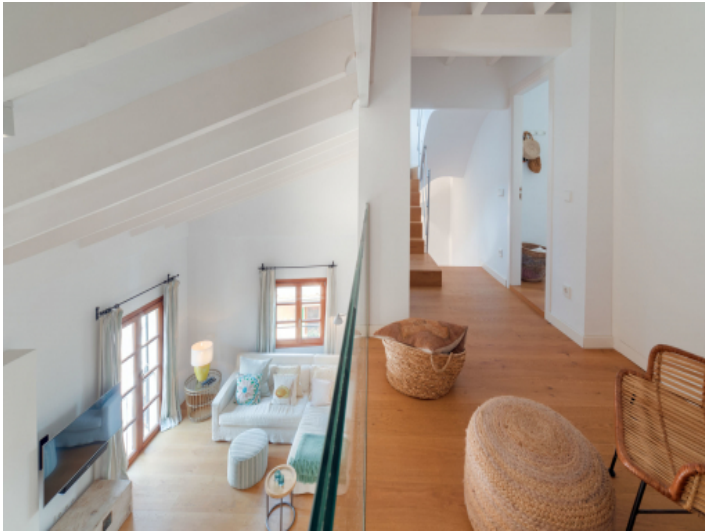
Wonderful gallery on the upper level