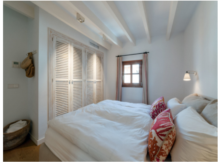
Comfortable double bedroom