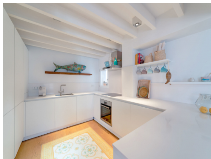
Modern kitchen with ample space