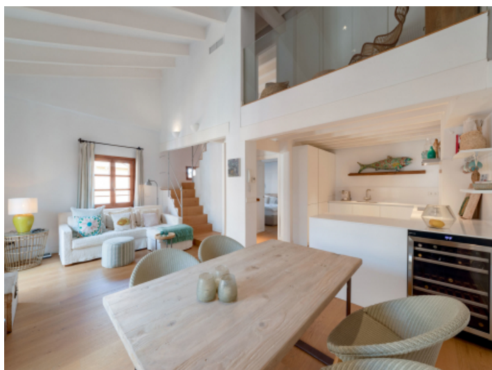
Open plan living, dining and kitchen area