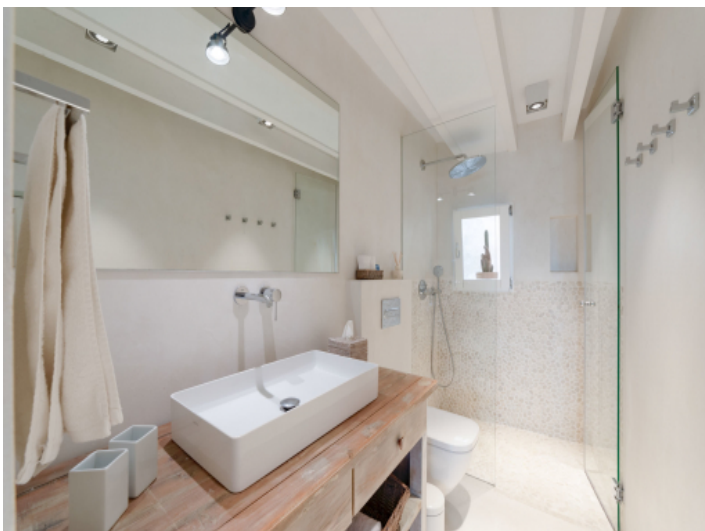
Second shower bathroom