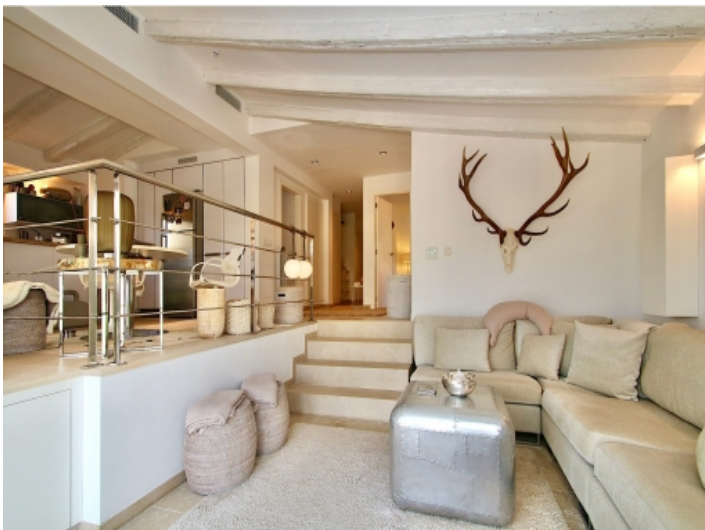
Living and dining area