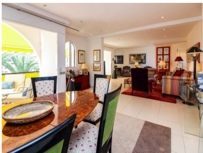
Spacious living and dining area