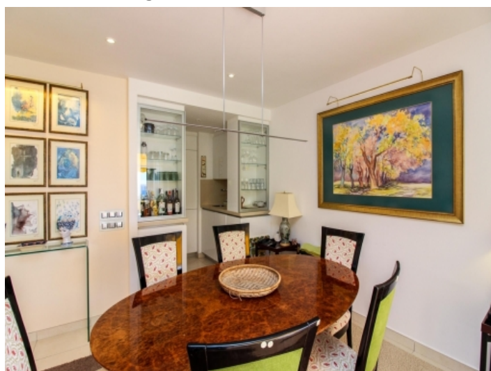
Dining table and kitchen