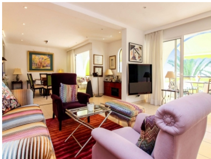
Living area with access to the terrace