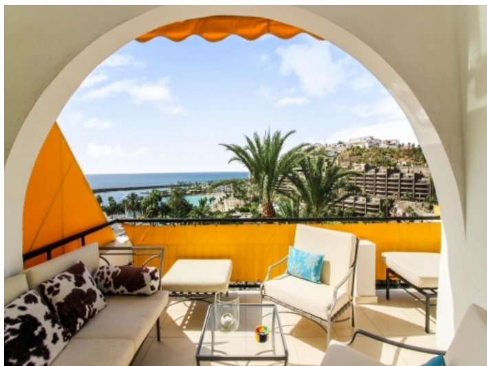
Spacious terrace with sea views