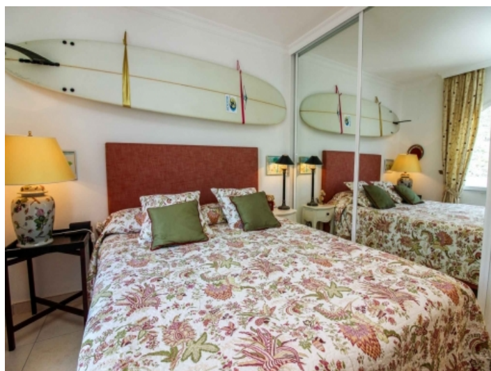
Bedroom with built-in wardrobe