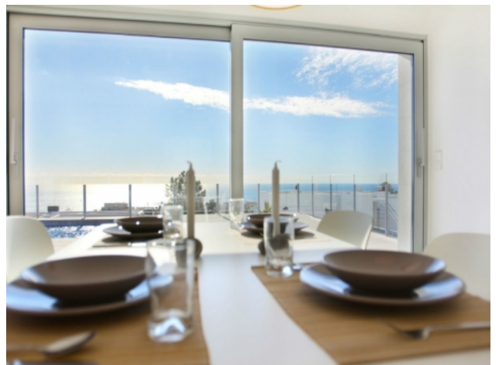
Dining area with view to the sea