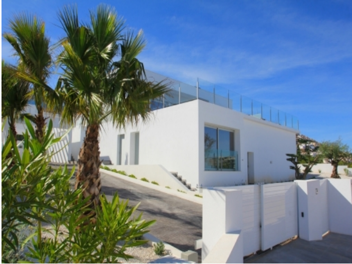
Entrance with motorised gate