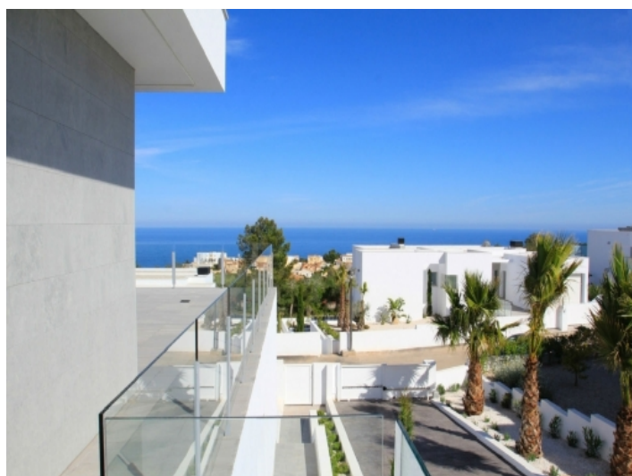
Amazing view to the sea