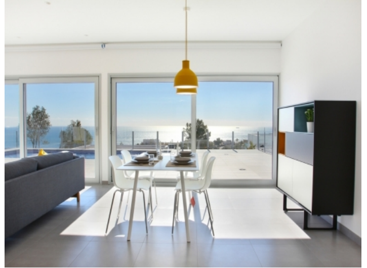
Bright living room with direct access to the pool area