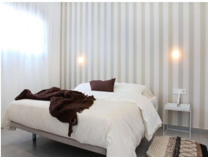
1 of 3 bedrooms