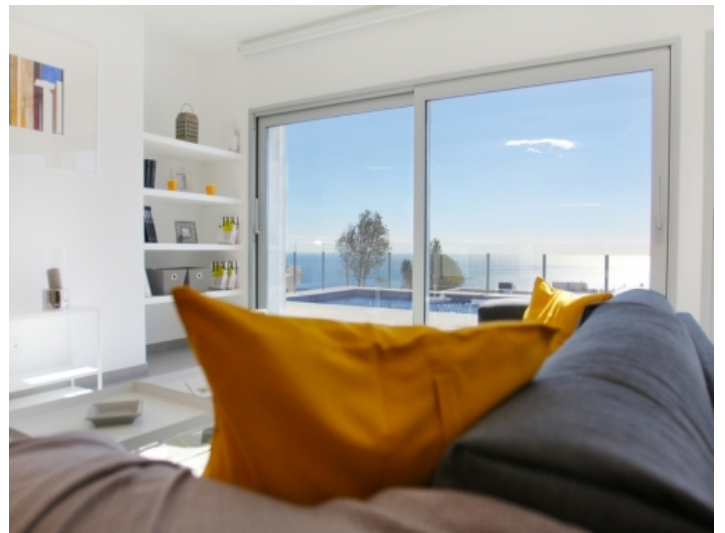
Living room with view to the pool