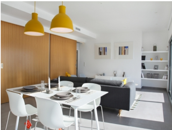
Stylish living room