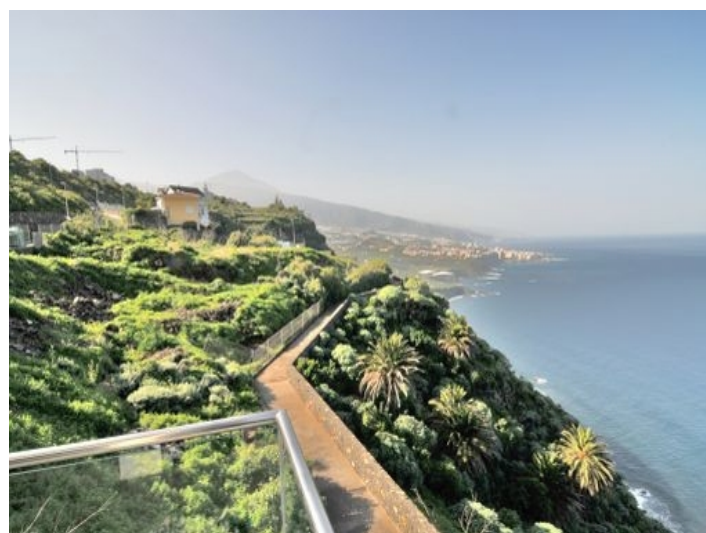
Fantastic views from the terrace to the Teide and the sea