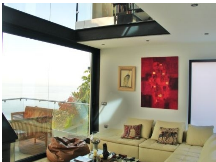
Bright living room with beautiful views to the sea