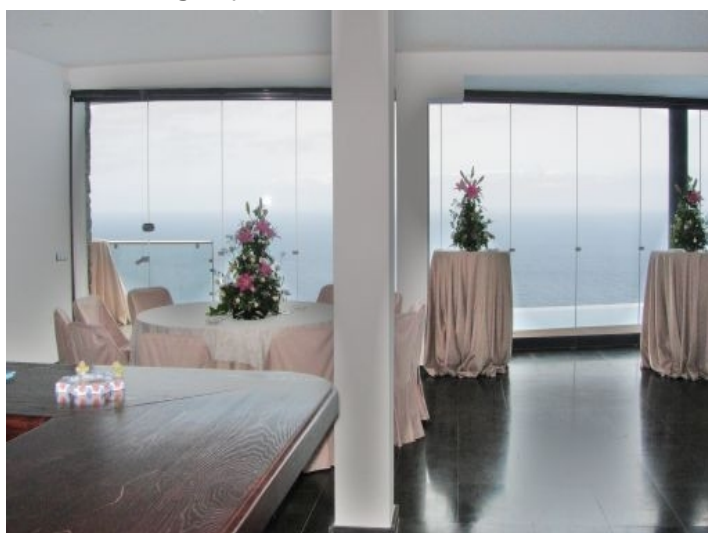
Modern room for larger events with dreamlike views to the sea