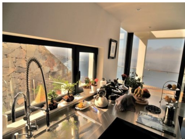
Fully equipped fitted kitchen with dreamlike views to the Atlantic Ocean

PORTA TENERIFE • CALLE LUIS DE LA CRUZ 10, 38400 PUERTO DE LA CRUZ, SPAIN