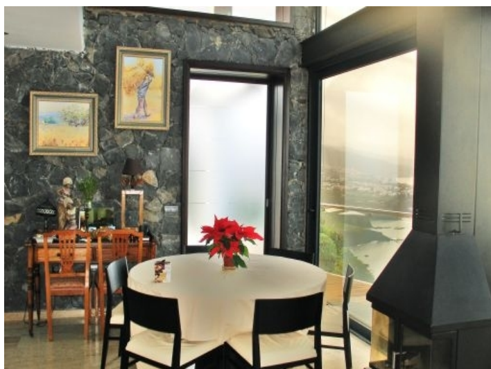
Classy designed dining room with a big panoramic window