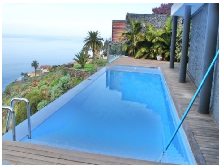
Large pool with a direct view to the Atlantic