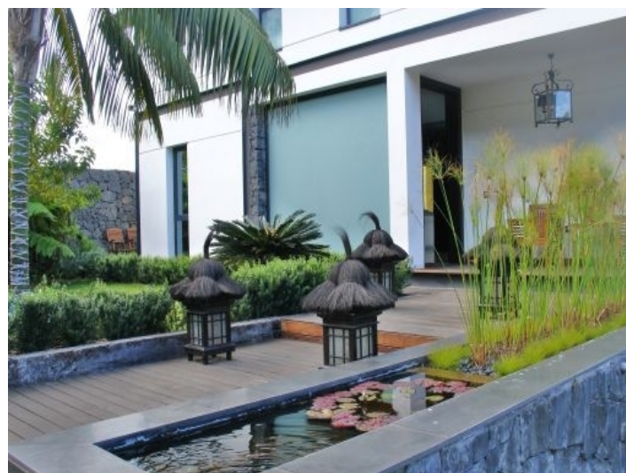
Nice garden with a small pond a terrace