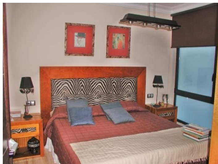
Modern bedroom with double bed and wardrobes