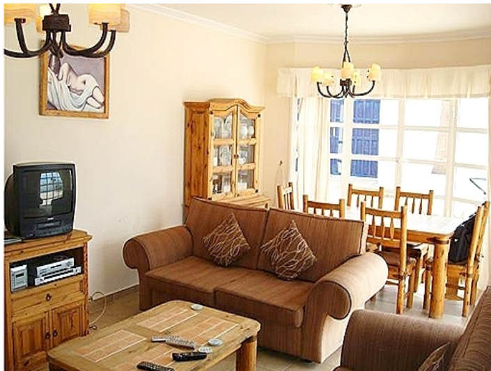
Modernly fitted living room