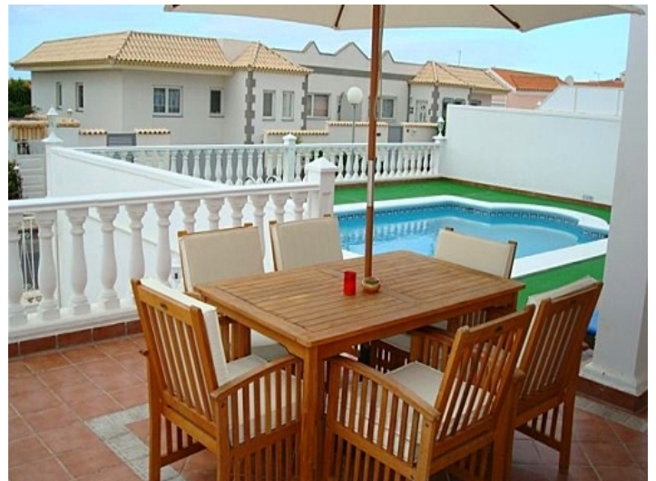
Terrace with view to the swimming pool