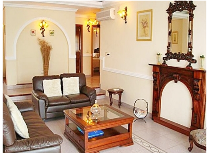
Spacious living room