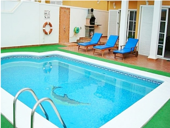
Swimming pool with sun terrace and barbecue area