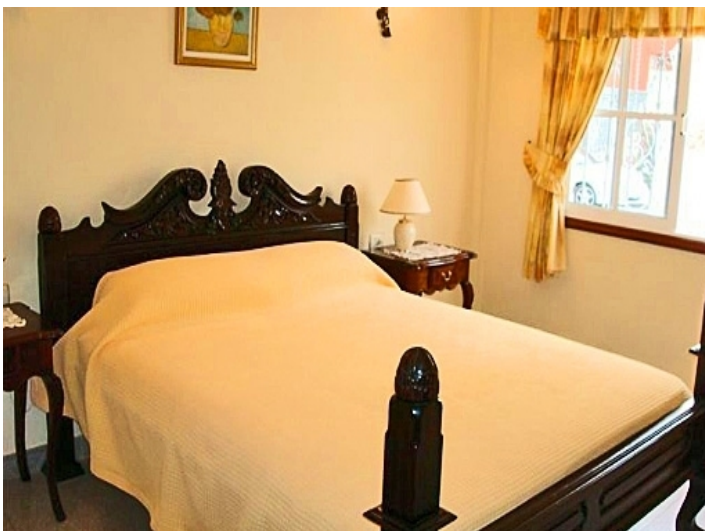
One of the 3 bedrooms