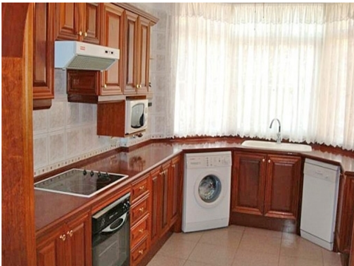
Ample kitchen with appliances and wooden furniture