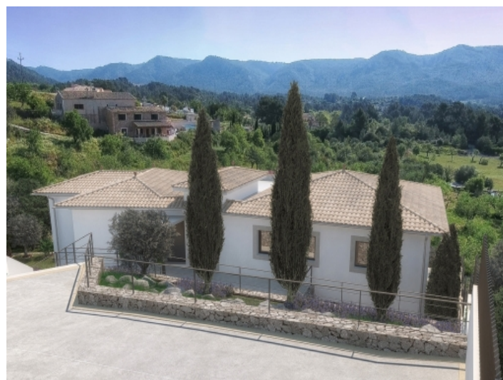
Unique landscape views from the balcony