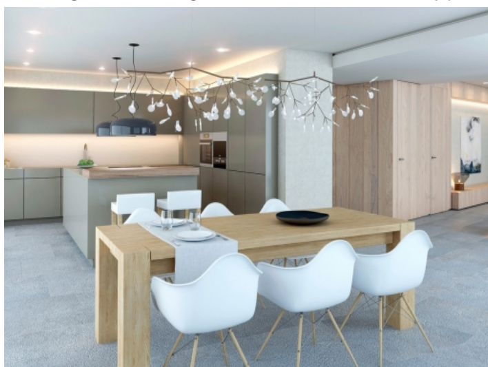
Modern kitchen and dining area