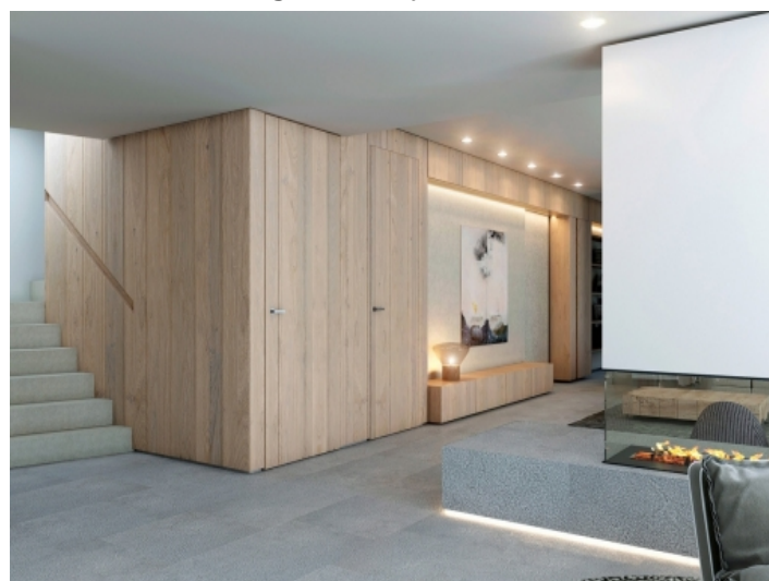
Delightful living area with fireplace