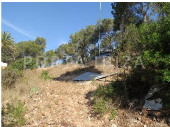
PLOT ORIG PIC 4