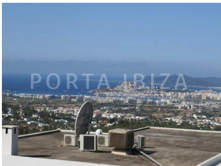
PLOT ORIG PIC 7