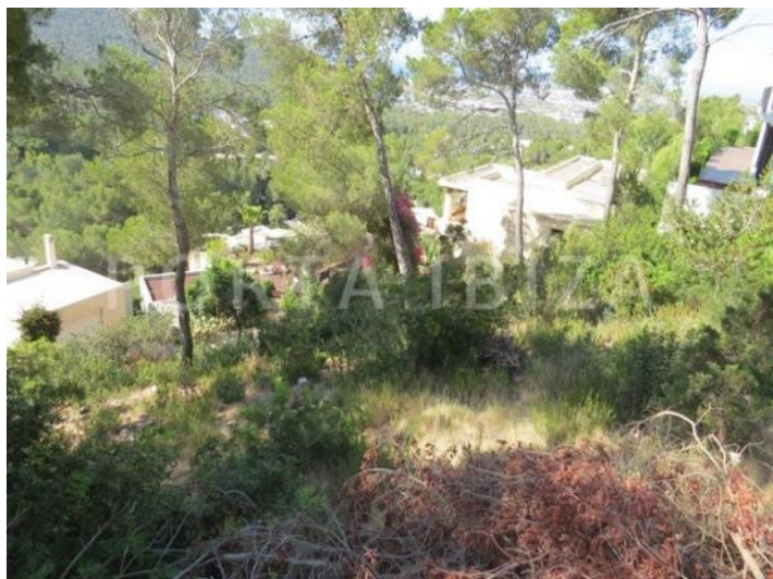
PLOT ORIG PIC 8