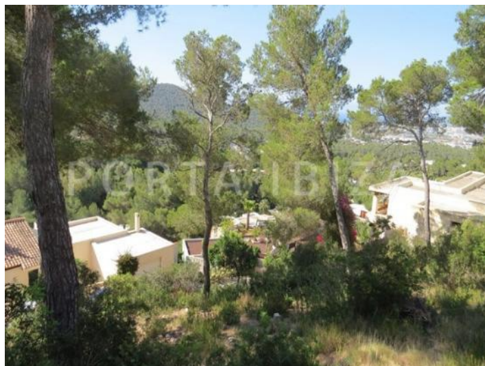
PLOT ORIG PIC 6

area-plot-project-Can-Furnet-amazing-view-to-sea-and-Ibiza