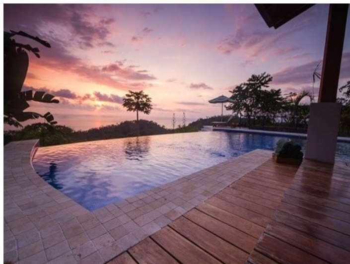
large infinity pool