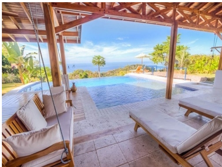
Terrace with sunbeds