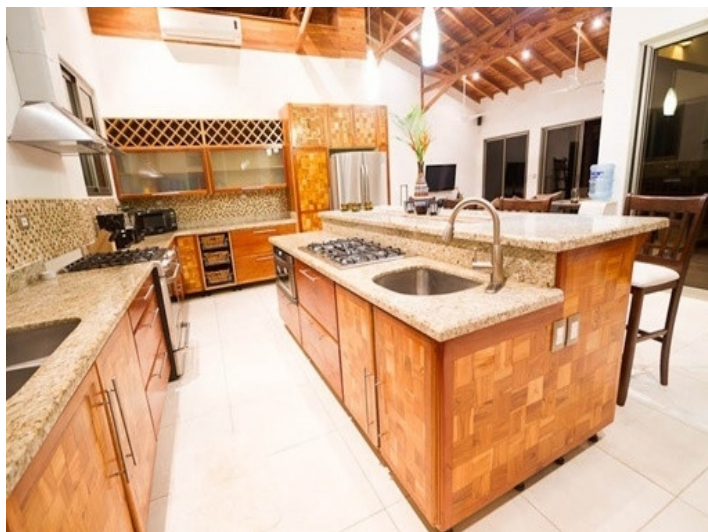
Large, well equipped kitchen