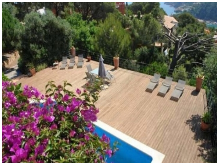
Dream swimming pool area