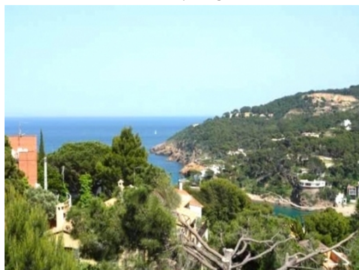
Breathtaking sea views