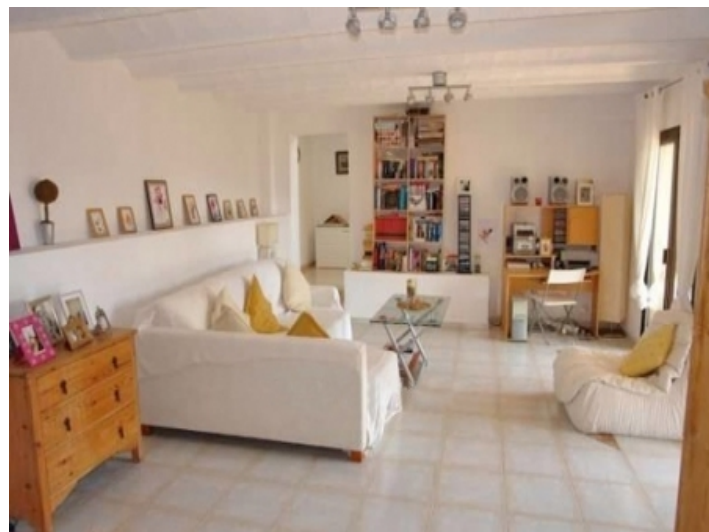
One of the airy living rooms