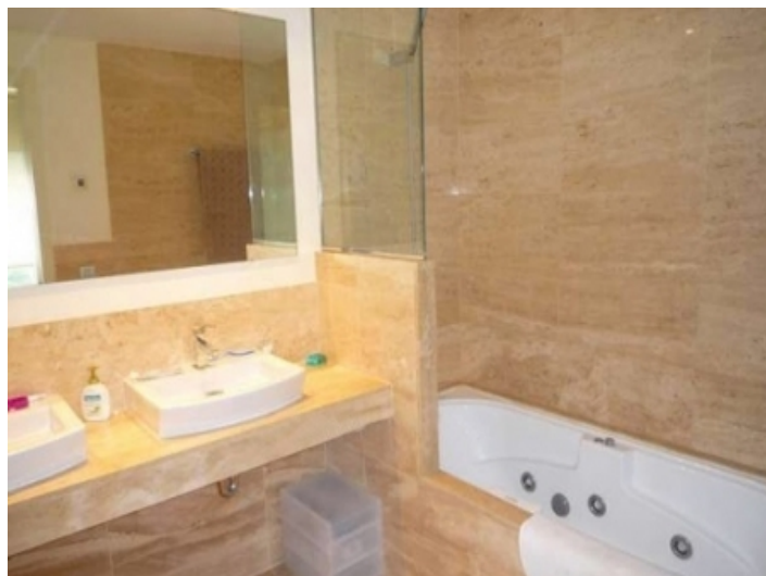
One of the 3 quality bathrooms