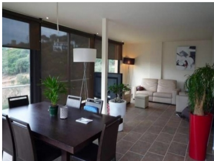
Open-floor lounge and dining room