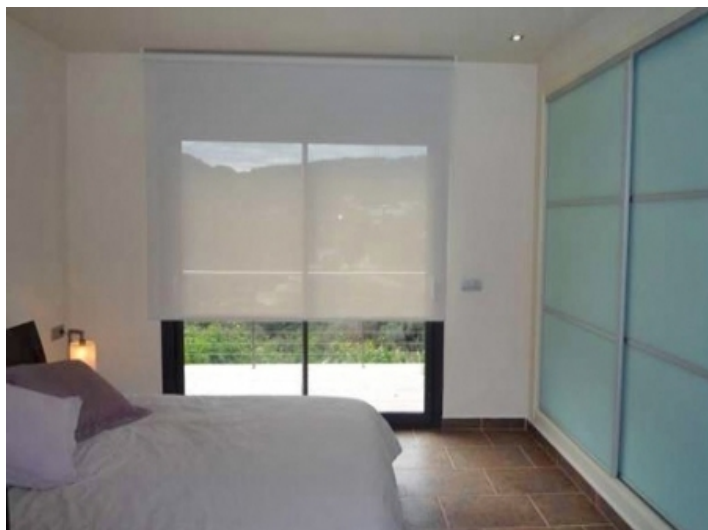
One of the 3 bright bedrooms