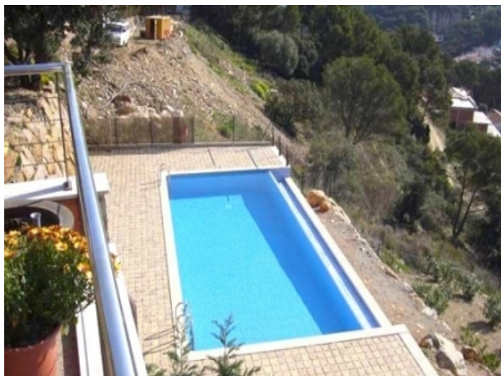
Community swimming pool