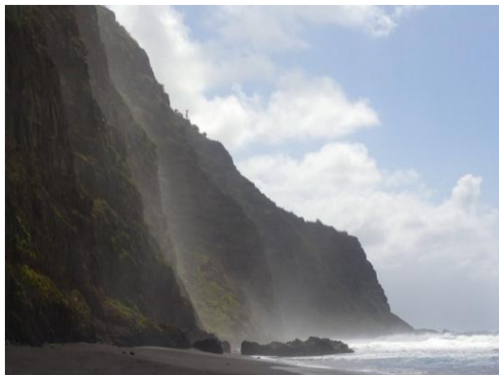
Romantic cliffs of Tenerife's beautiful north coast