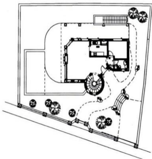
Floor plan of the chalet with a living area of 212 m 2