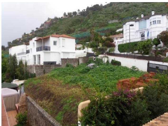
Reasonable even plot in the sought-after settlement Los