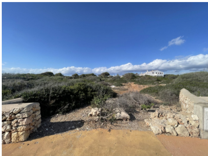
Magnificent investment plot, first line of sea, sea view,