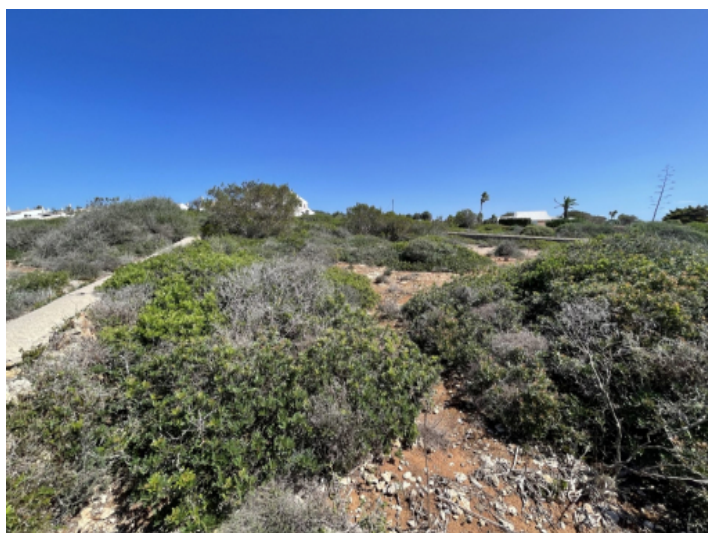
Magnificent investment plot, first line of sea, sea view, located in Binidali, Menorca.