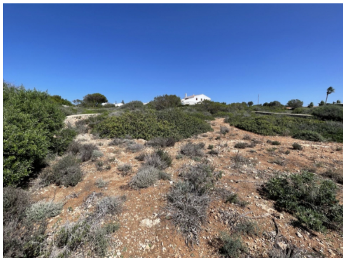
Magnificent investment plot, first line of sea, sea view,