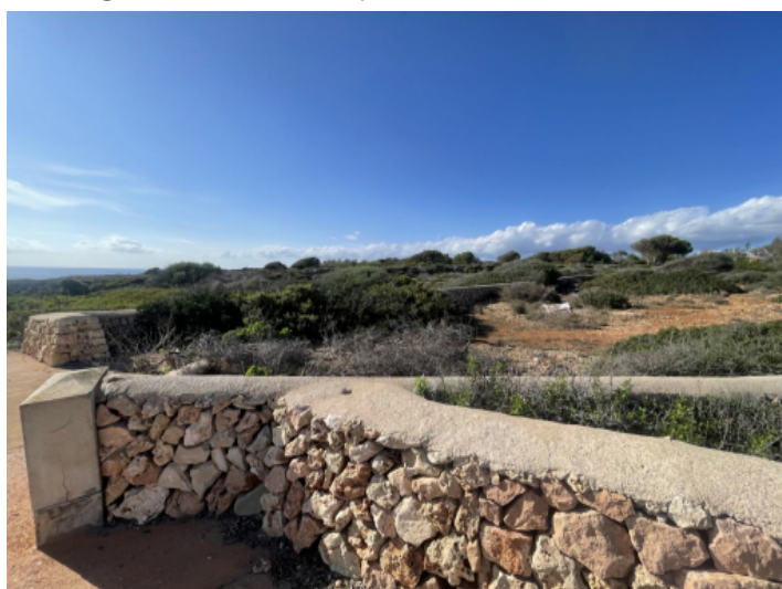
Magnificent investment plot, first line of sea, sea view,