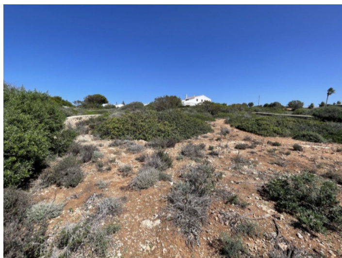
Magnificent investment plot, first line of sea, sea view, located in Binidali, Menorca.

PORTA MONDIAL MENORCA • AVENIDA FORT DE L'EAU, 175, LOCAL 6, 07701 MAHÓN, MENORCA, SPAIN TEL.: +34 871 510 261 • MENORCA@PORTAMONDIAL.COM • WWW.PORTAMONDIAL.COM/EN/MENORCA/