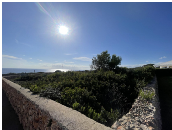
Magnificent investment plot, first line of sea, sea view,