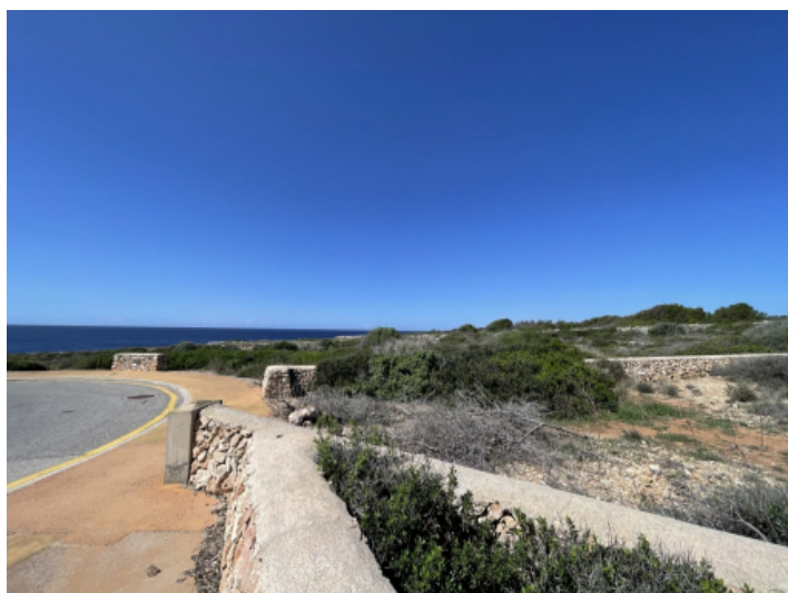
Magnificent investment plot, first line of sea, sea view, located in Binidali, Menorca.