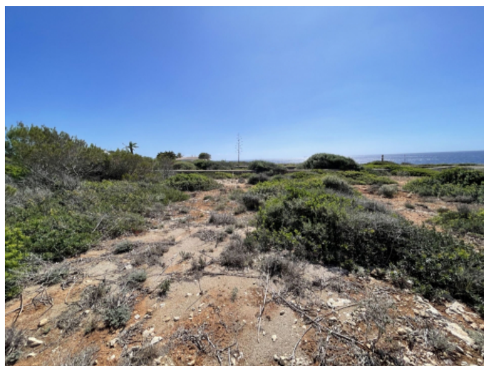
Magnificent investment plot, first line of sea, sea view, located in Binidali, Menorca.

PORTA MONDIAL MENORCA • AVENIDA FORT DE L'EAU, 175, LOCAL 6, 07701 MAHÓN, MENORCA, SPAIN TEL.: +34 871 510 261 • MENORCA@PORTAMONDIAL.COM • WWW.PORTAMONDIAL.COM/EN/MENORCA/