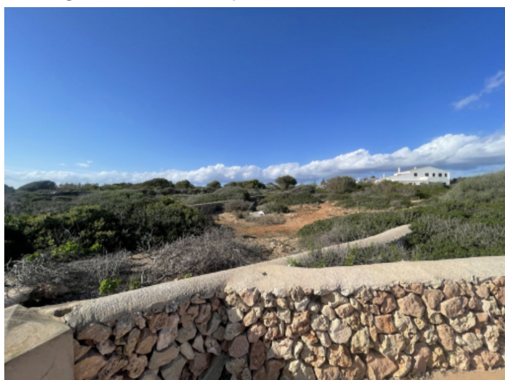
Magnificent investment plot, first line of sea, sea view,