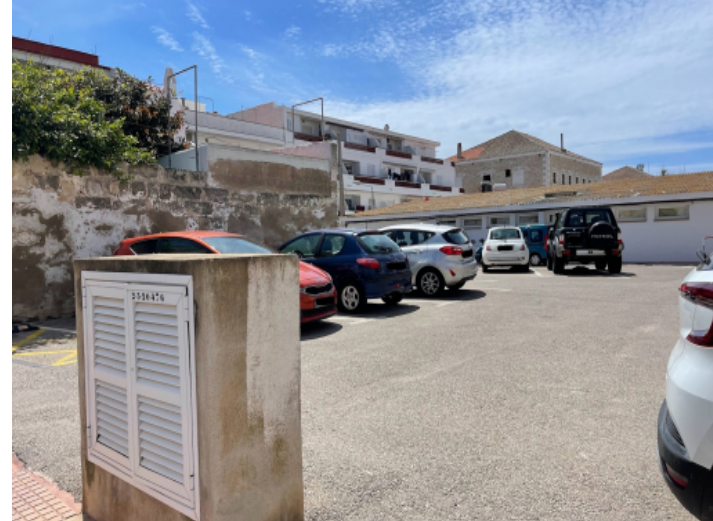
Terreno 8 Terreno 9