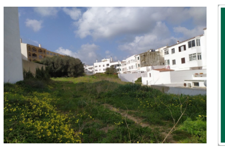
Alaior search for property MEN-100512