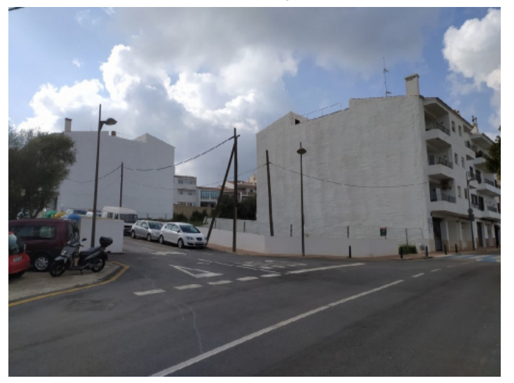
View from the street