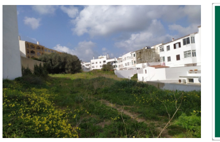
Alaior search for property MEN-100512