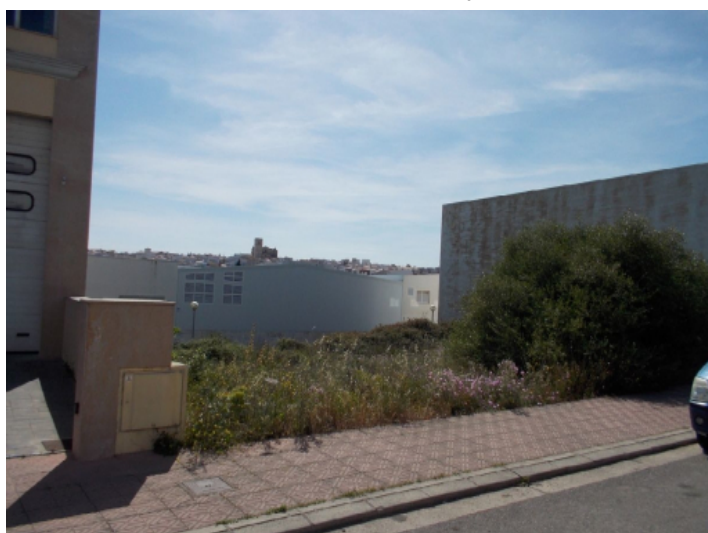
Back view of the plot