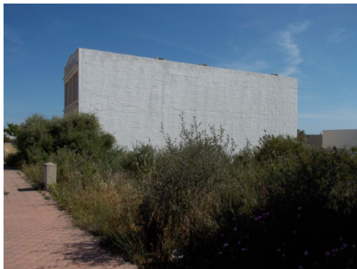
Alternative view of the plot