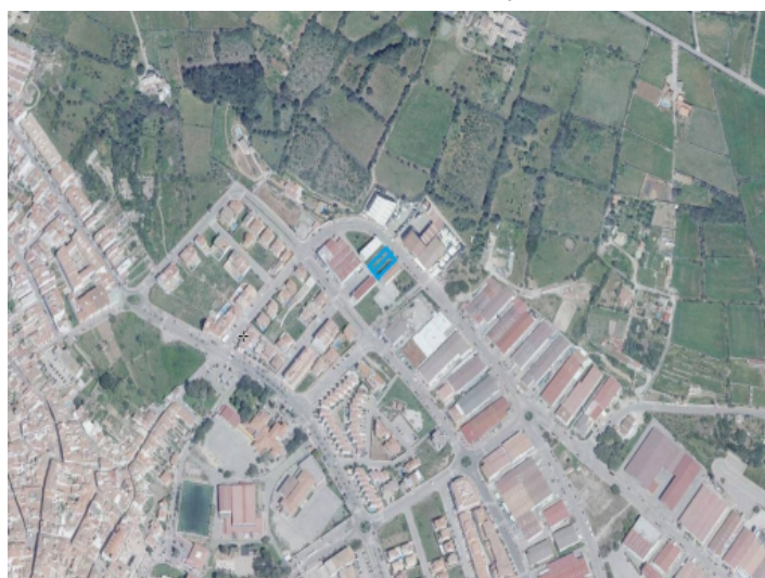
Location of the plot