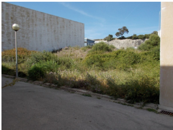
Alternative view of the plot