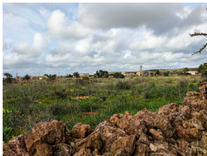
Plot for a finca