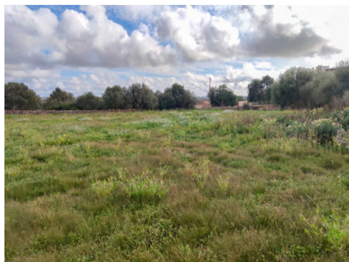
Plot for a finca