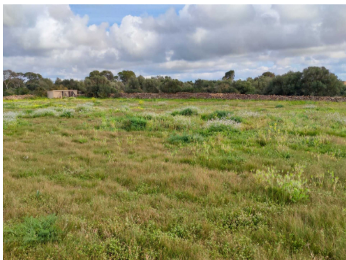
Plot for a finca