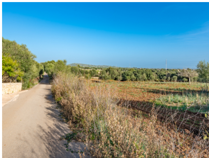
Asphalted road to the plot