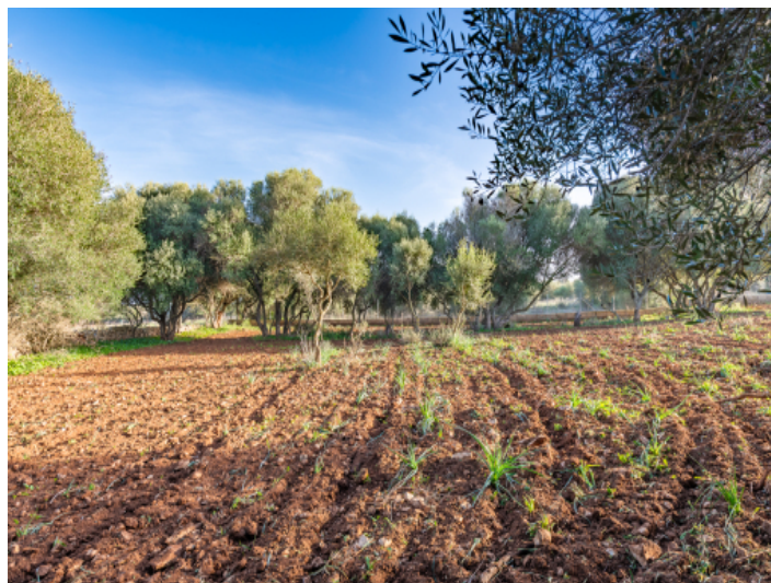
Close to Porto Cristo