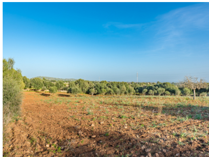
An approx. 69 sqm pool with adjoining sun terrace is planned