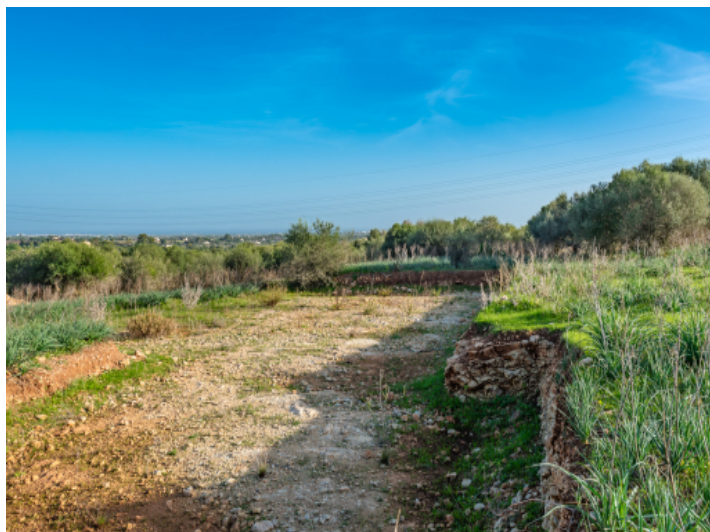
Plot with seaviews