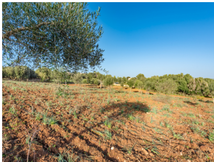
Plot with building project