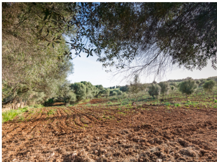
A construction project for a country house with pool