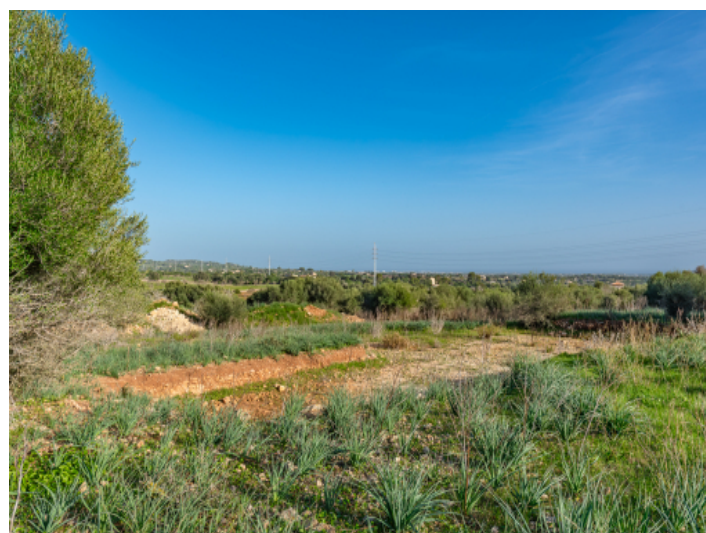
Plot with sea views