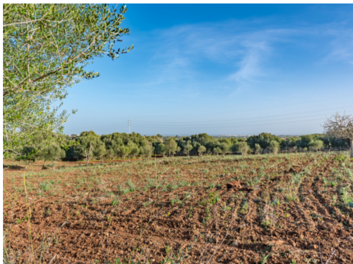
Flat building plot