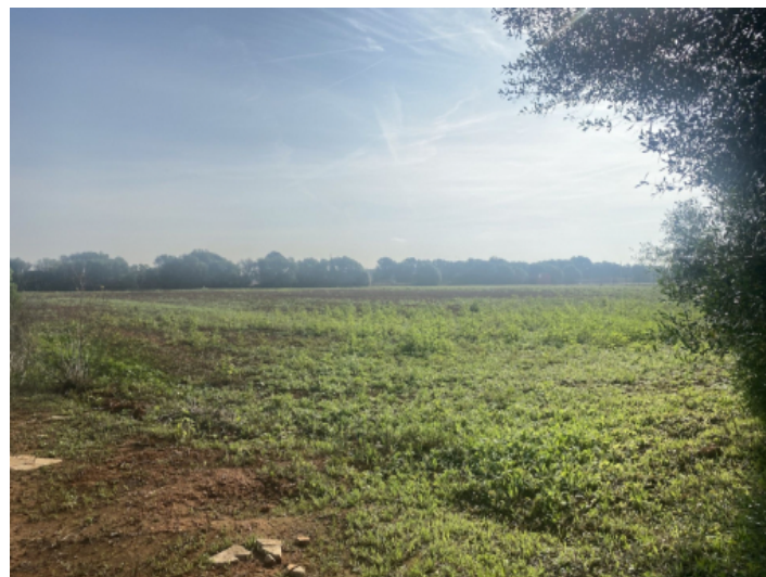
Plot with construction project