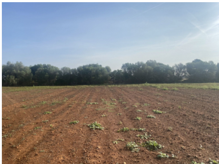
Plot with views