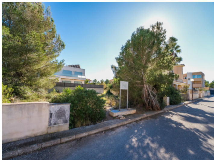
Street views to the plot