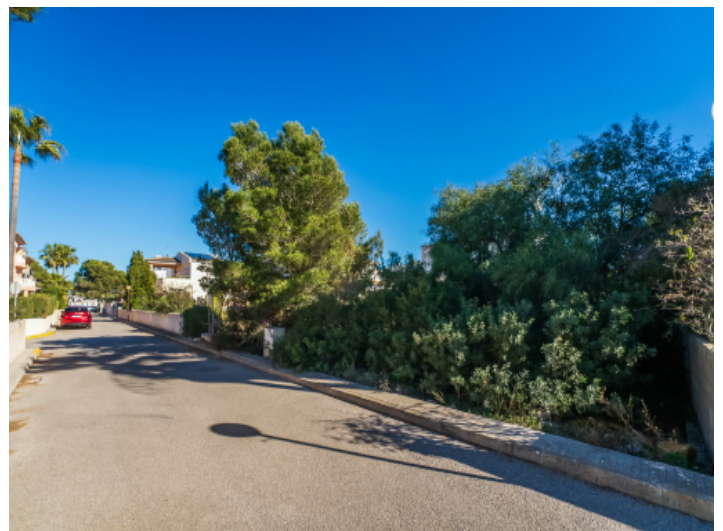
Views from the street