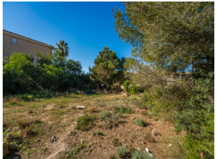
Plot with building permission