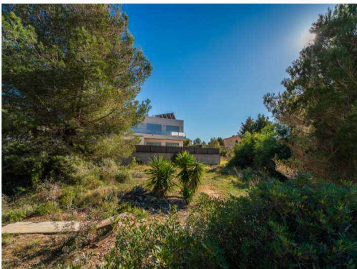
Possible to built a two storey house