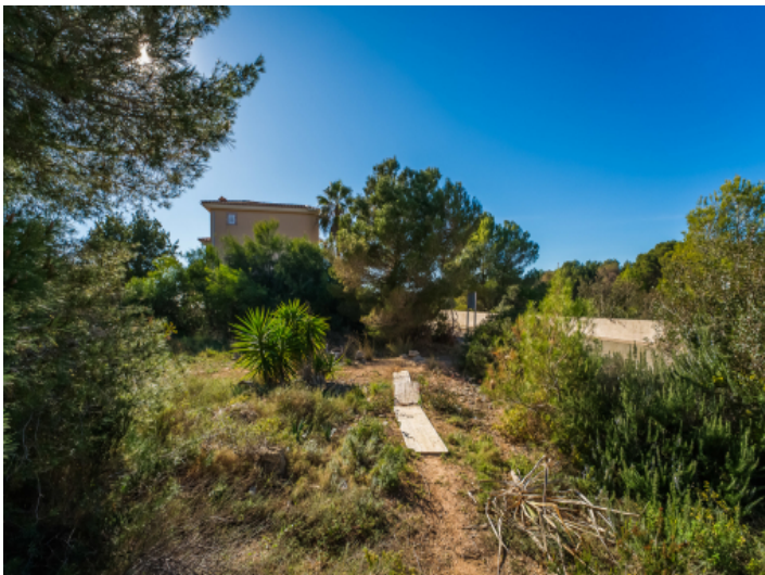
Plot in Can Picafort