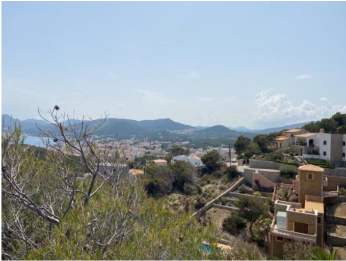
Construction plot with a view in Capdepera