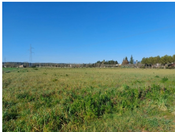
View of the plot