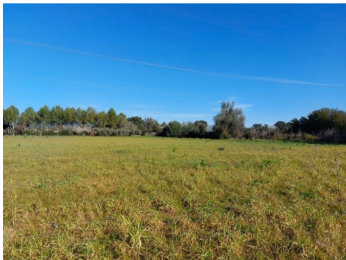
View of the plot