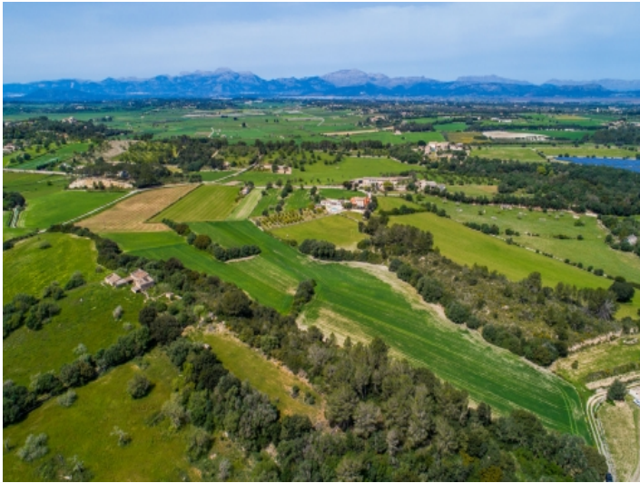
Plot with Sierra de Tramuntana in the background