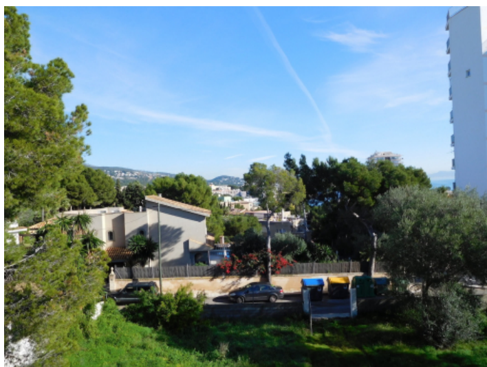
Partial sea views