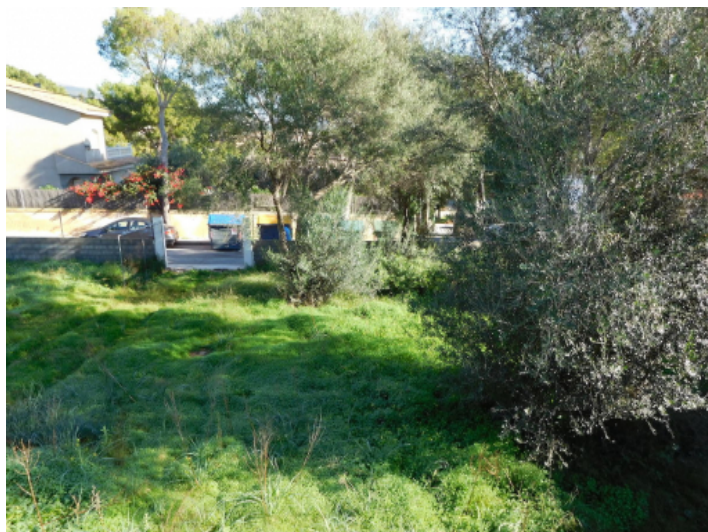
View of the plot