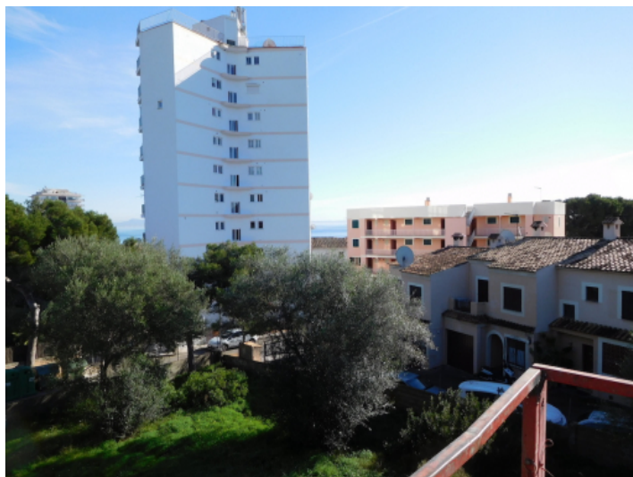
View of the surroundings