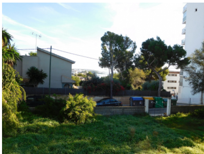
View of the plot