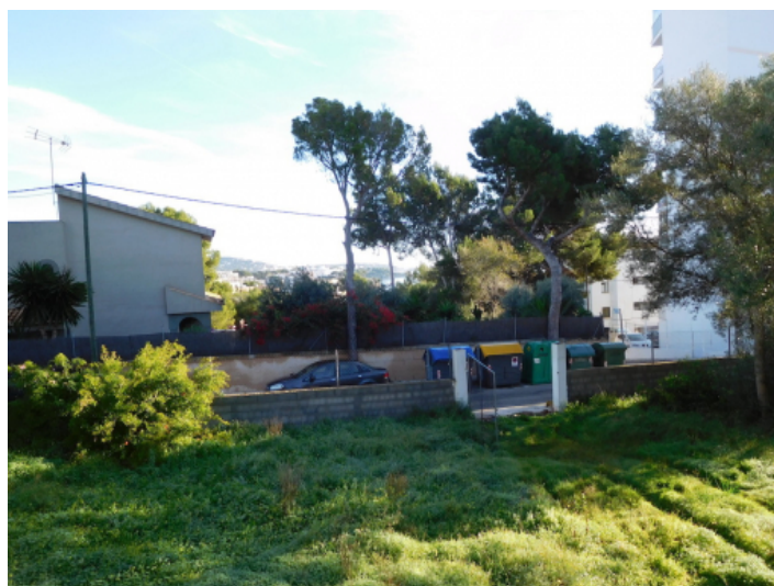
View of the plot