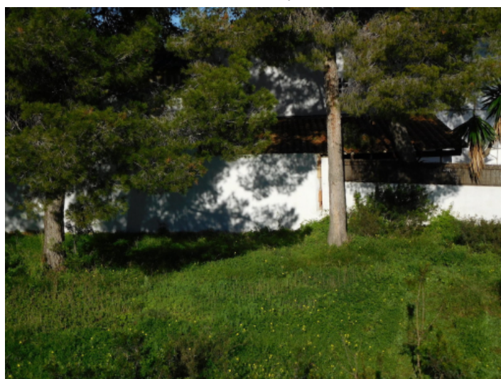
View of the plot