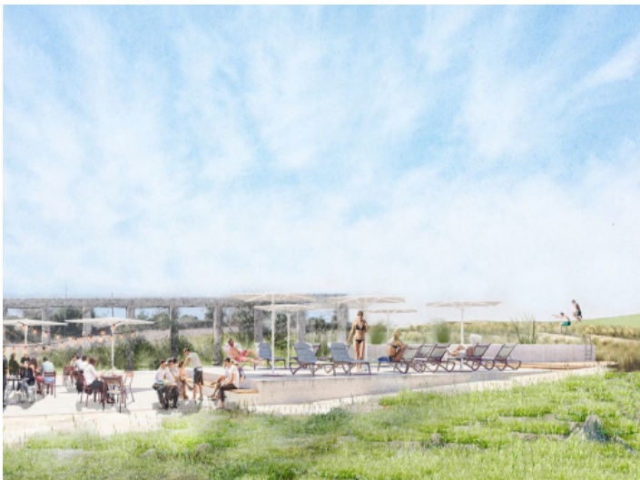
Possible pool area