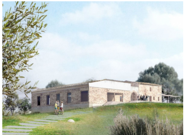
Exterior view of the project