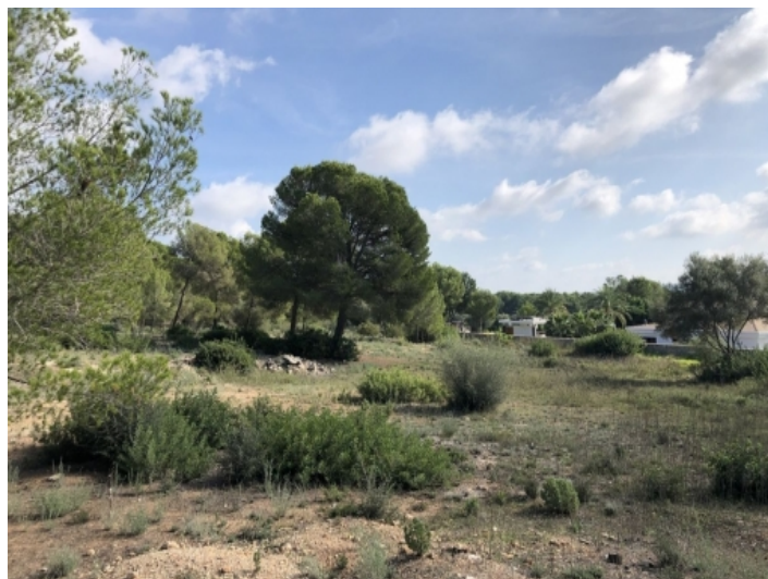
Golf courses nearby