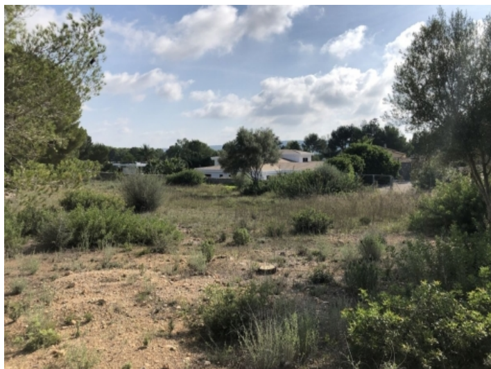
Views of the large plot