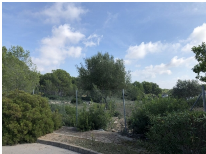
Access to the plot