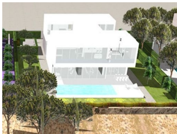
Alternative view of the project