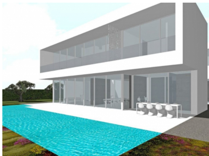
Alternative view of the project