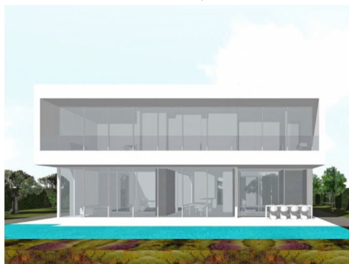
Alternative view of the project