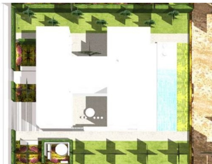
Alternative view of the project