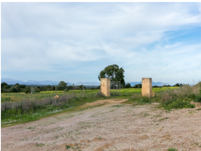
Access to the plot