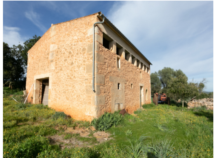
A 2-storey house already exists