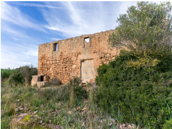
Alternative view of the house