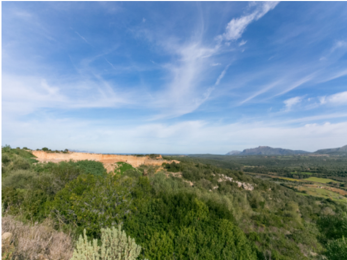
Dreamlike views over the landscape