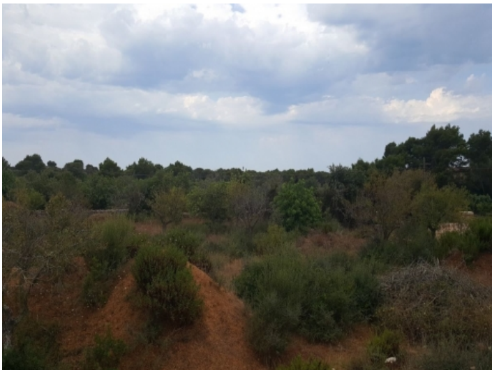
Views over the plot