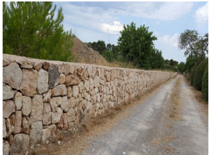
There are newly-built Mallorcan walls