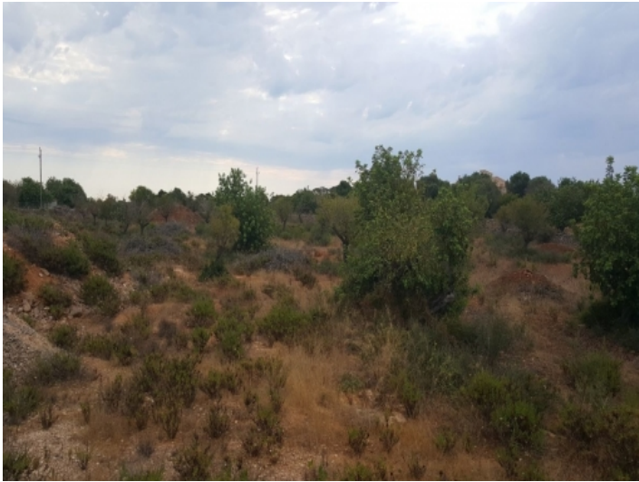
The plot offers sea views