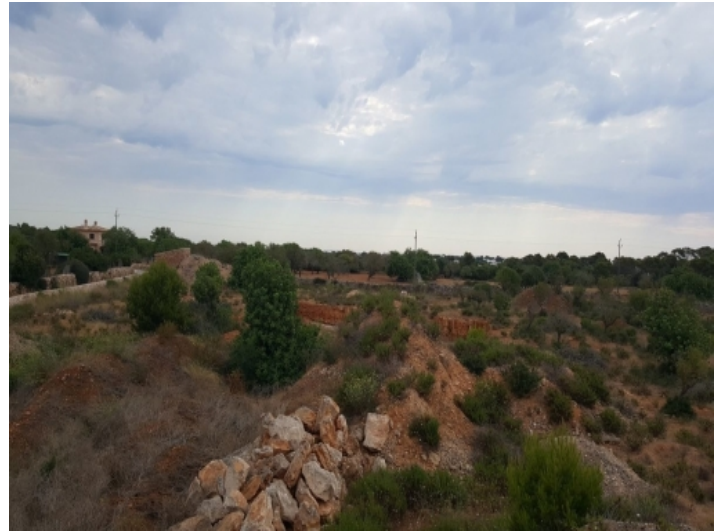
It exists a basis project for a house