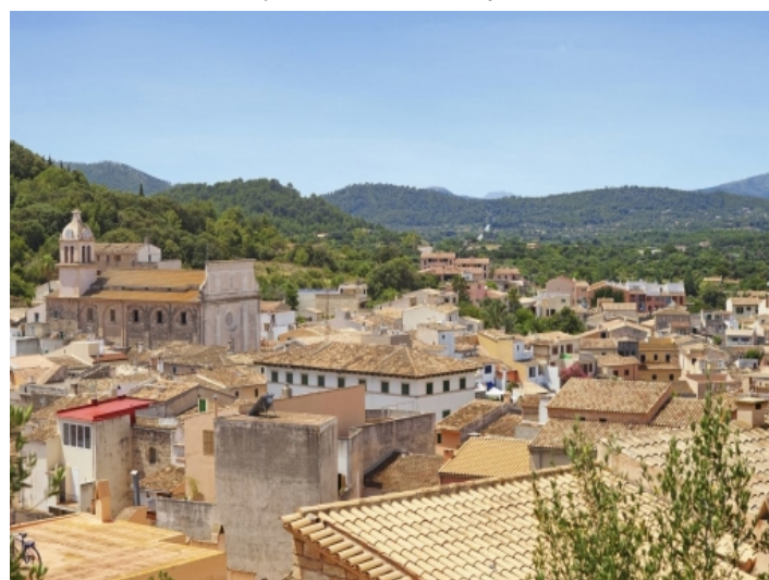
Views of Capdepera