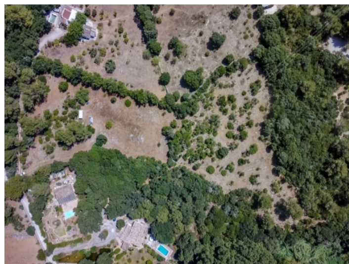
The plot from a birds-eye view