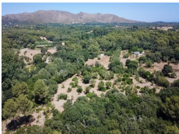
Stunning landscape views