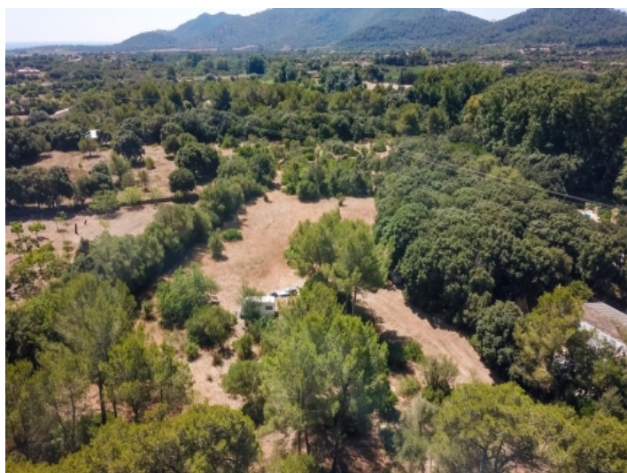
The plot measures 16.135 sqm