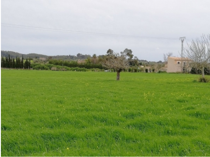
Flat and square building plot