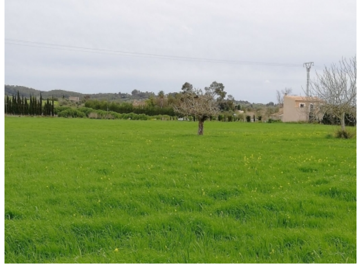
Flat and square building plot