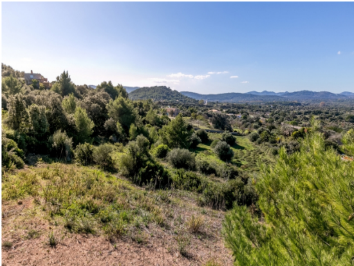
Lovely, hilly landscape