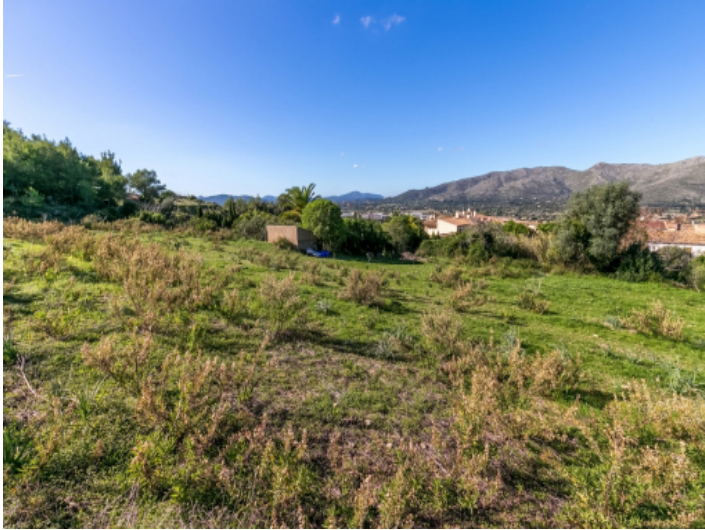
The building plot has a size of 32.625 sqm