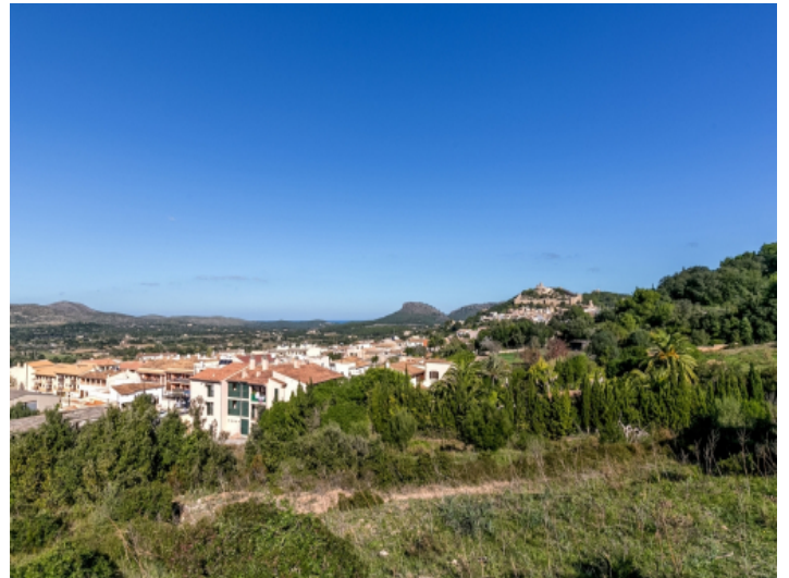
Wonderful views over the mountains and the castle of Capdepera