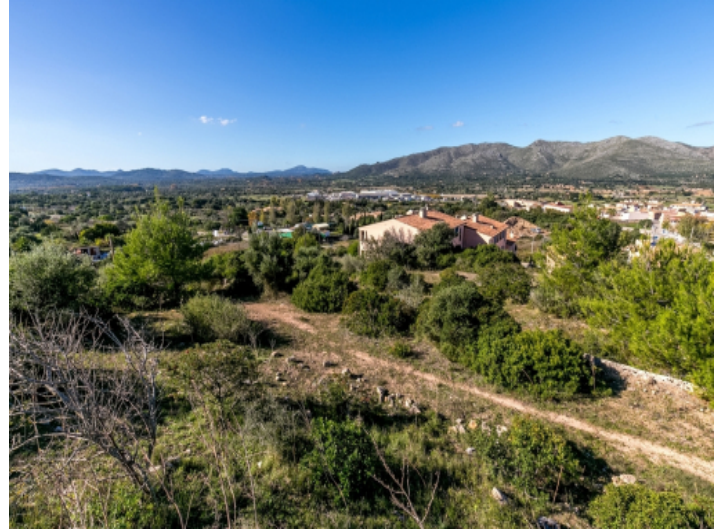
The plot is situated between the towns of Capdepera and Cala