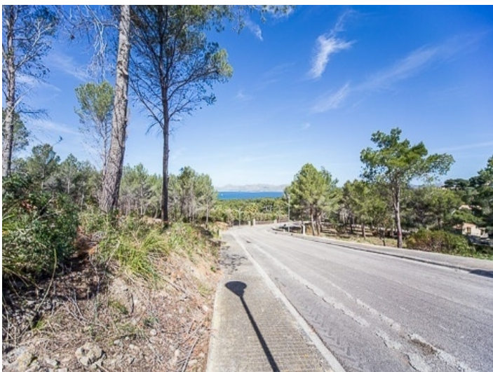
Building plot of 1000 sqm