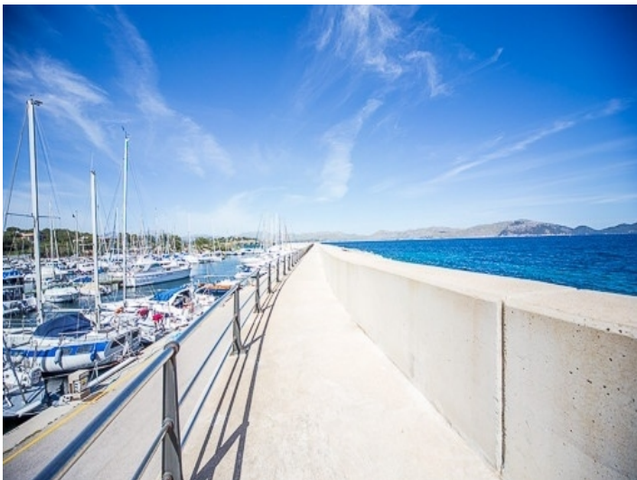
Exklusive building plot