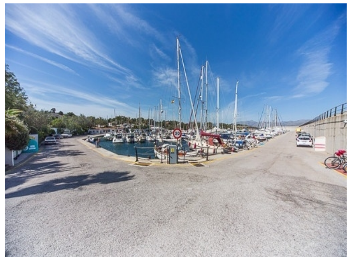
Harbour of Bonaire nearby