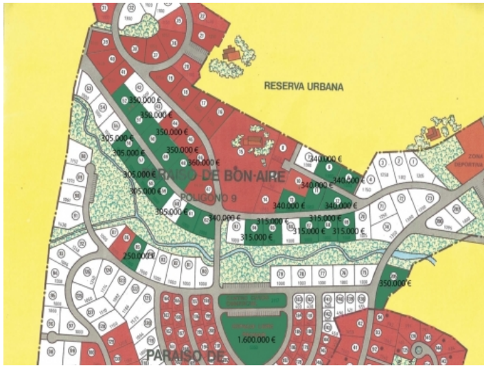
20210313 Mapa con precios