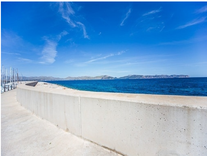
Nearby the sea