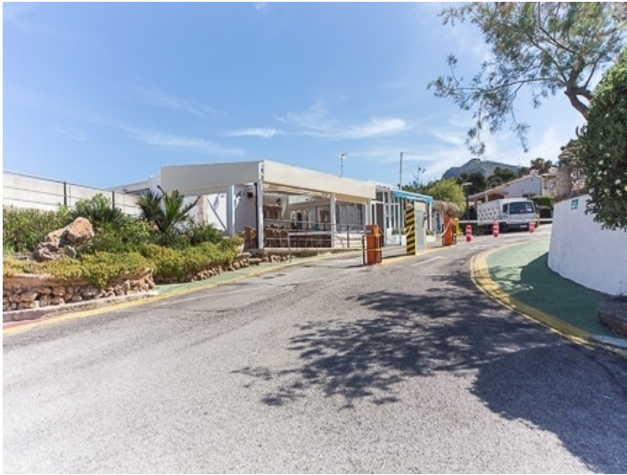
Access to the urbanization