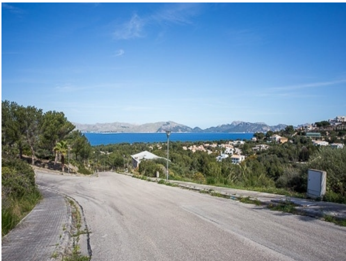
Impressive sea views