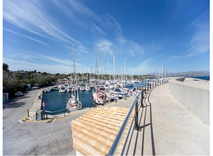
Views of the harbour