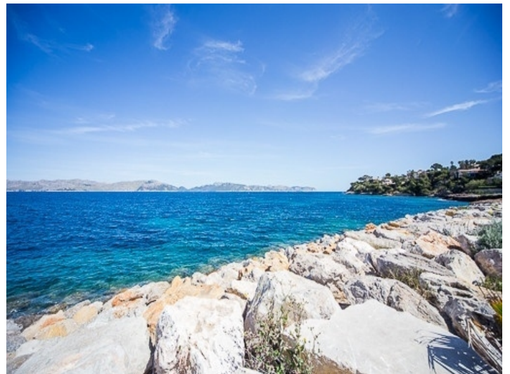
Fantastic location near the sea