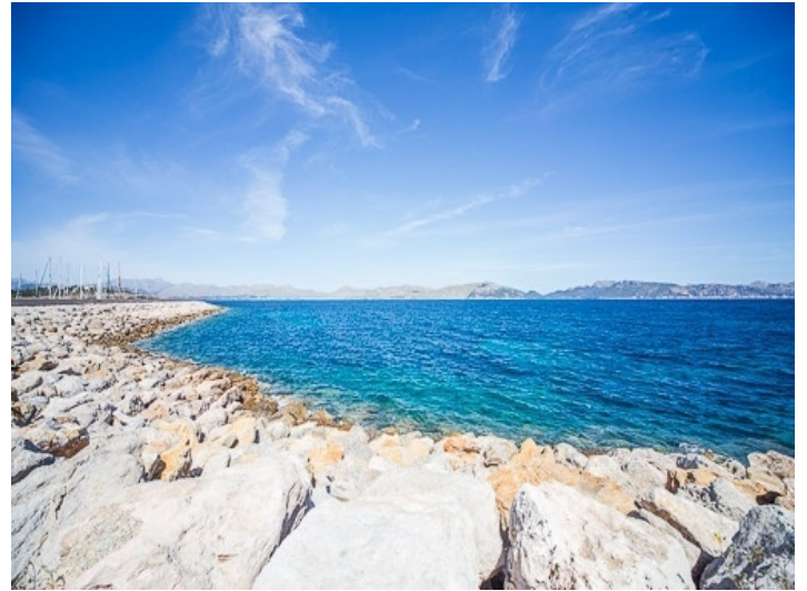
Spacious plot in the exclusive urbanization of Bonaire