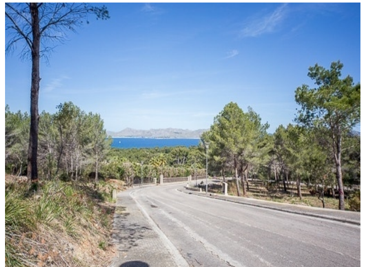
Elevated plot with nice sea views