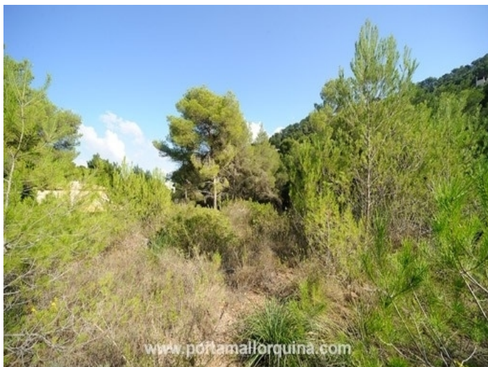
Plot of 683 sqm