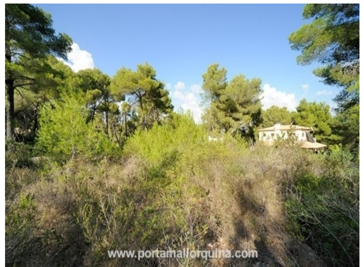
Plot without project