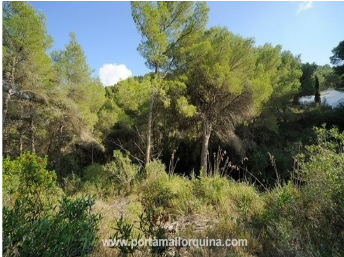
Plot in Canyamel