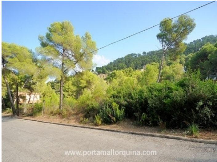
Views from the street