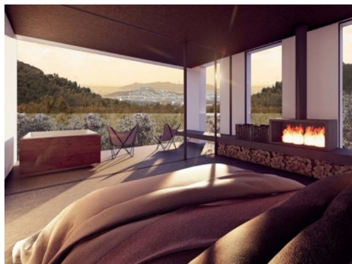
Bedroom with views to Dalt Vila