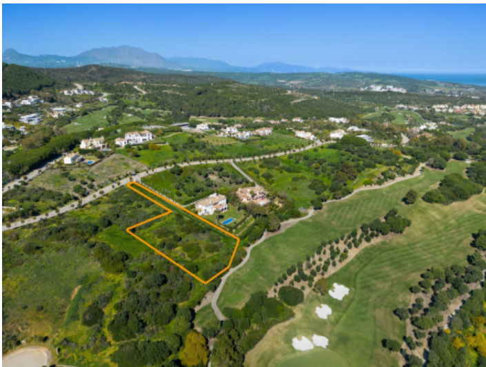
Plot of land