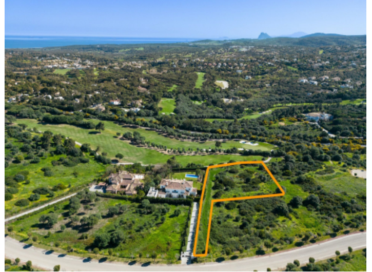
Plot of land nearby the sea