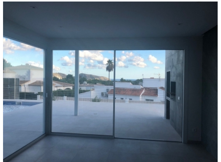
Sea view from the living room