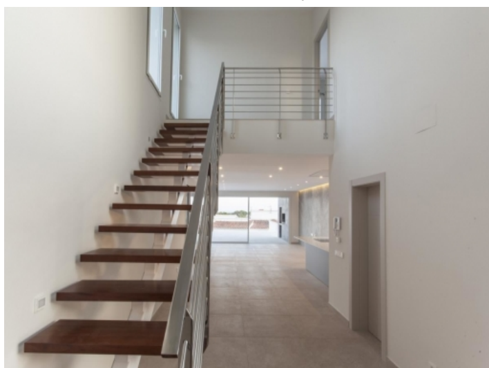
Stairs to the second floor