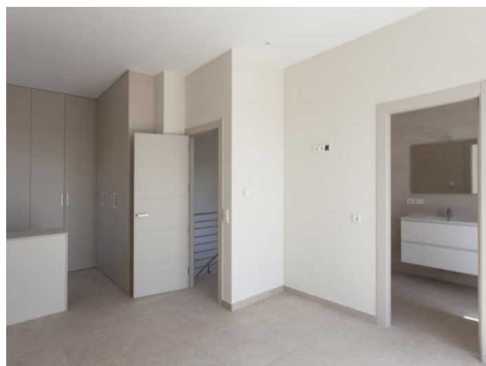
First floor with built in wardrobe