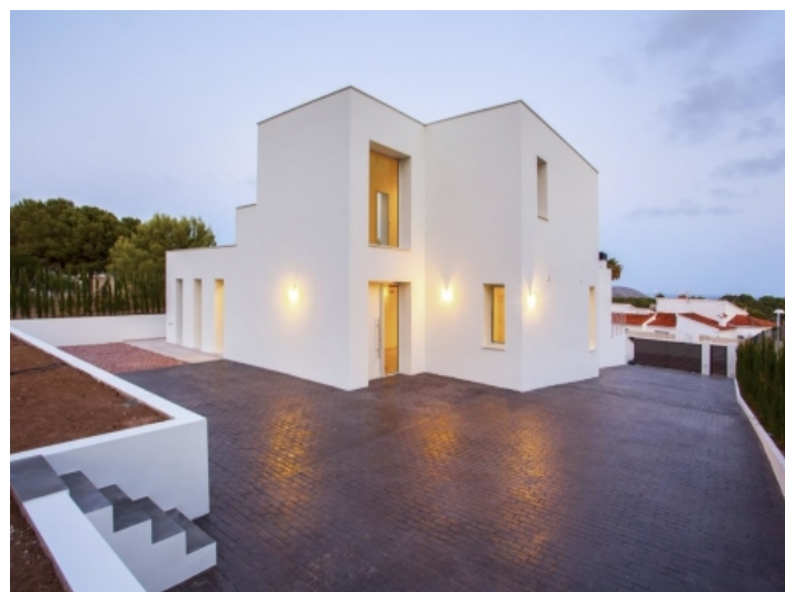
Rear view of the villa