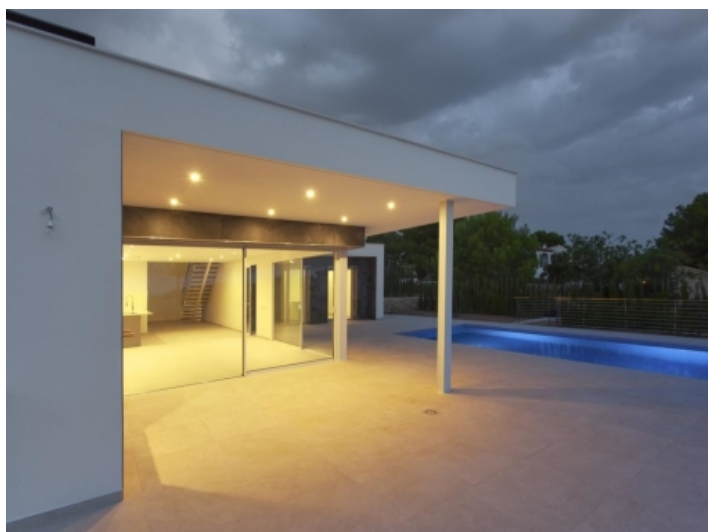
Outside area with pool