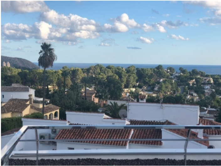
Stunning sea view from the terrace