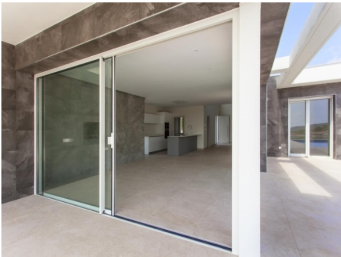
Open plan living room