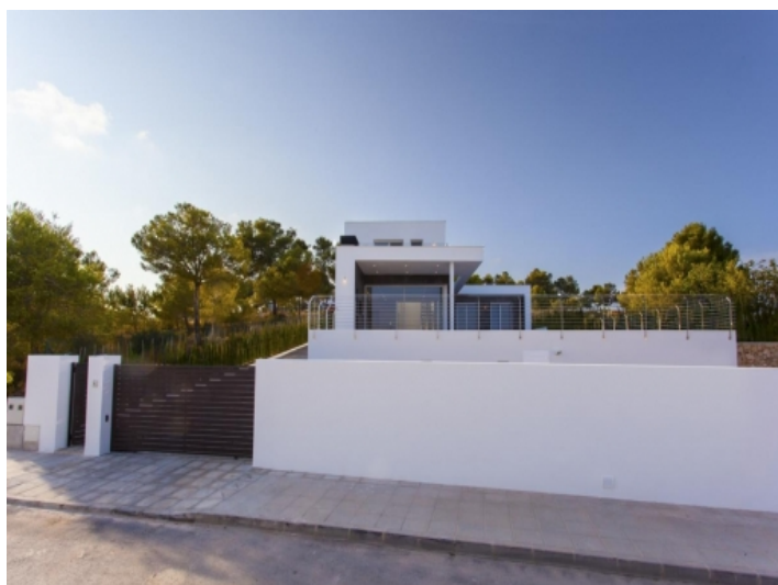
Front view of the villa