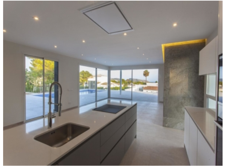
Living room with access to the pool