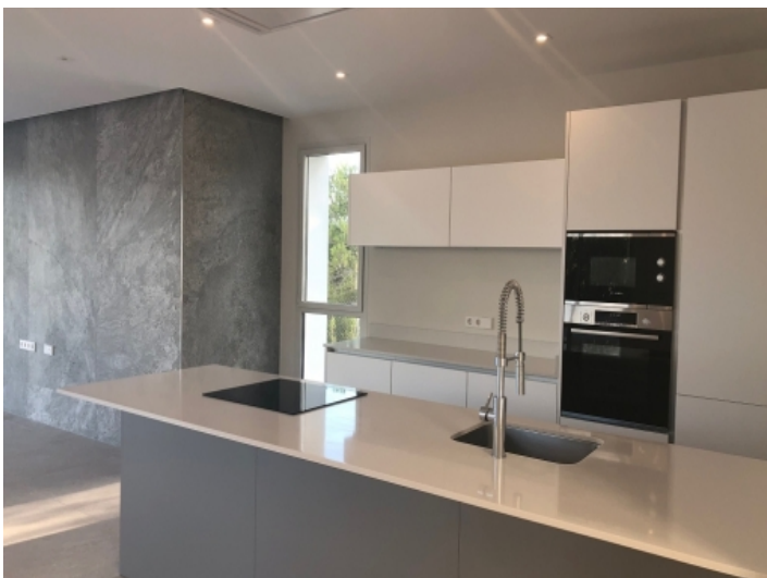
Fully equipped kitchen