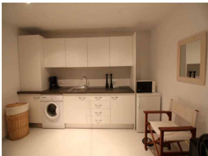
Further equipped kitchen