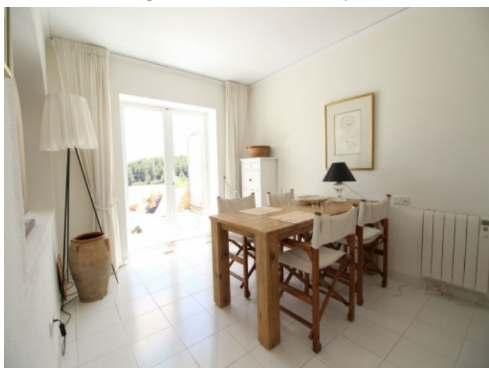
Dining room with direct access to the terrace