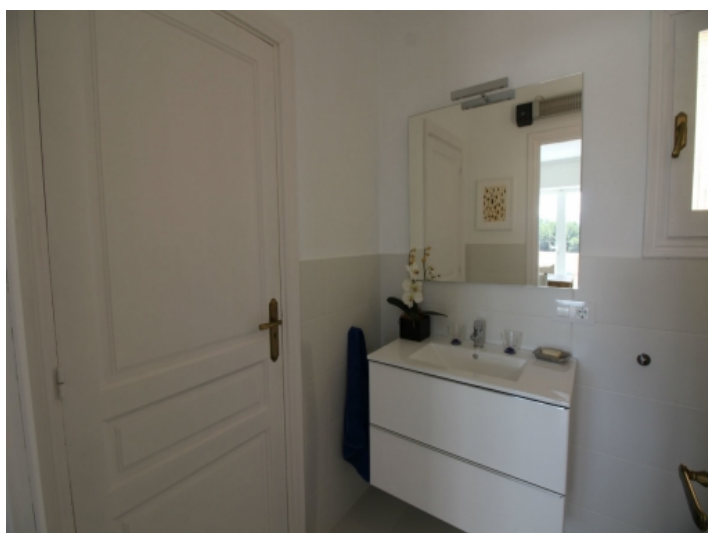
Bathroom with daylight