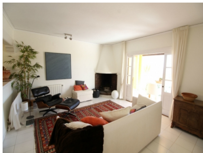
Light flooded living room with fireplace