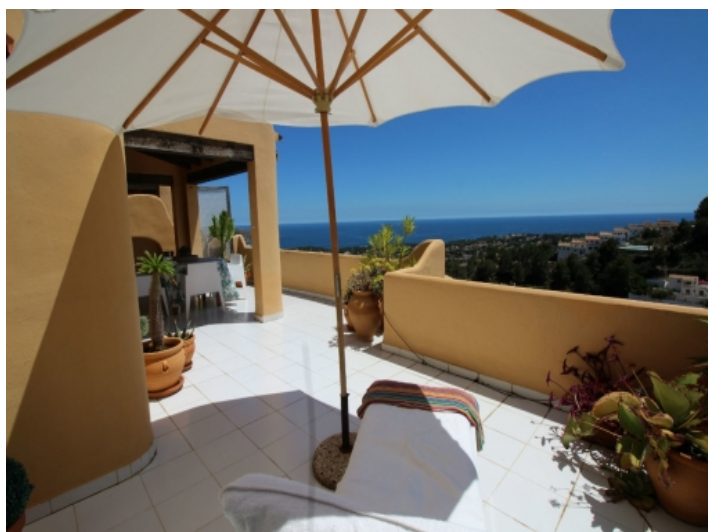
Stunning sea views from the sunny terrace