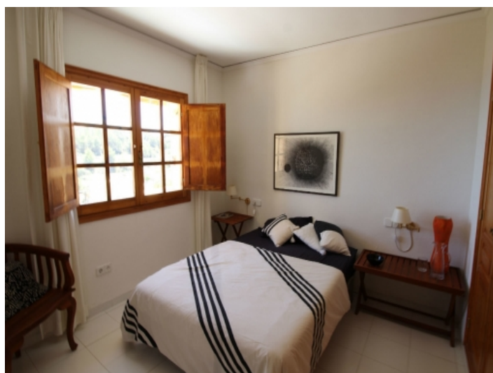
Bedroom with built-in wardrobe