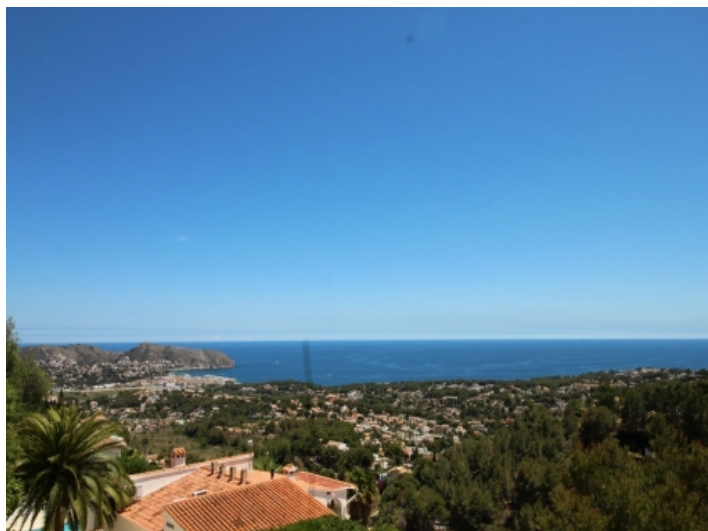
Breathtaking view of the sea