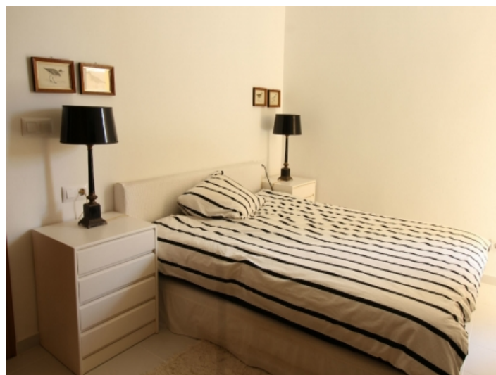
Bedroom with double bed