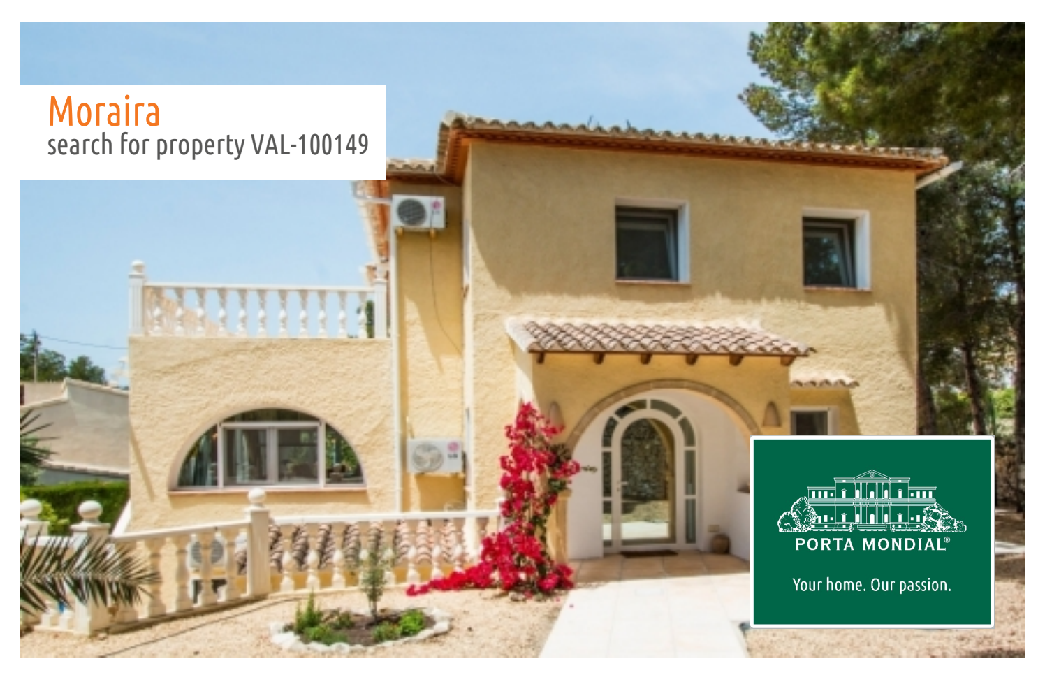
Beautiful villa with sea view in Moraira, Alicante