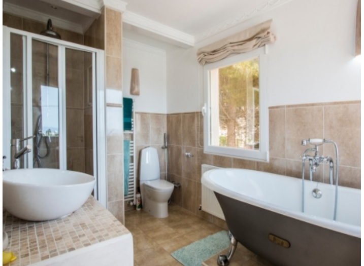
Bathroom with bathtub and daylight