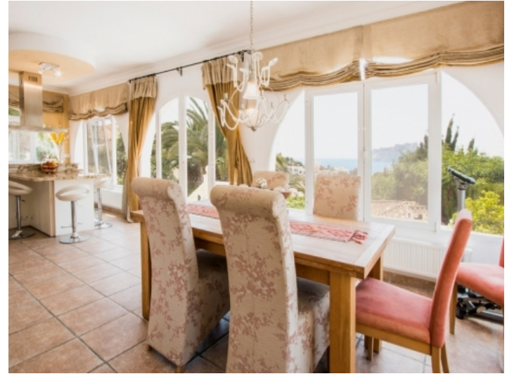
Dining area with view of the sea