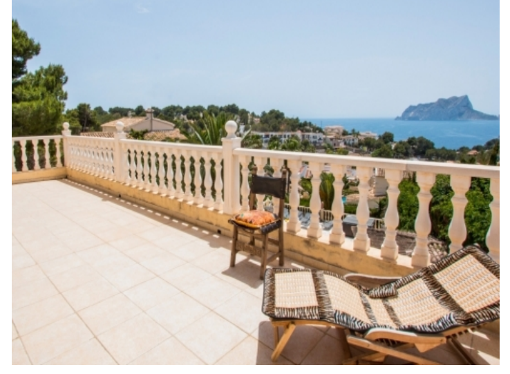
Stunning view of the sea and the surrounding landscape