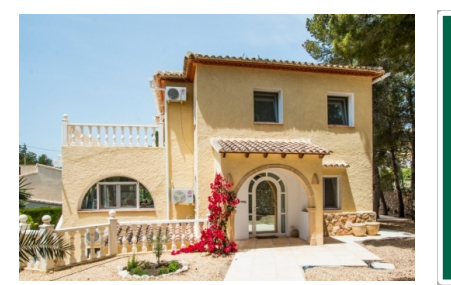
Moraira search for property VAL-100149