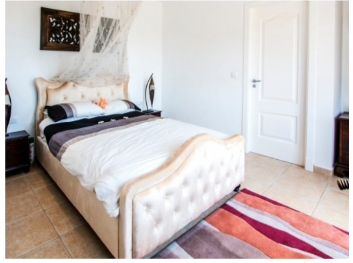
Capacious bedroom with double bed

PORTA MONDIAL VALENCIA • C./ COLOM 20 1°, 07001 PALMA DE MALLORCA, SPAIN TEL.: +34 971 720 164 • VALENCIA@PORTAMONDIAL.COM • WWW.PORTAMONDIAL.COM/EN/VALENCIA/