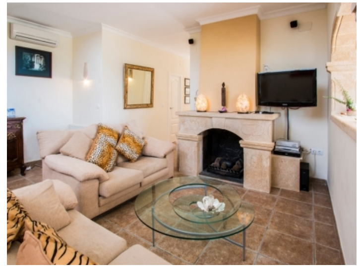
Cozy living area with fireplace