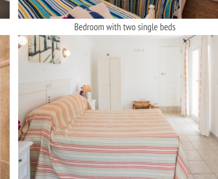
Light-flooded bedroom with double bed