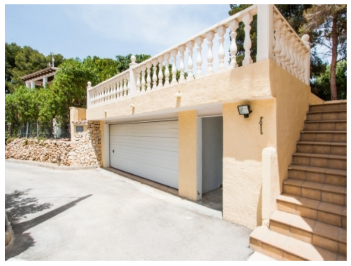
Spacious garage with space for two cars