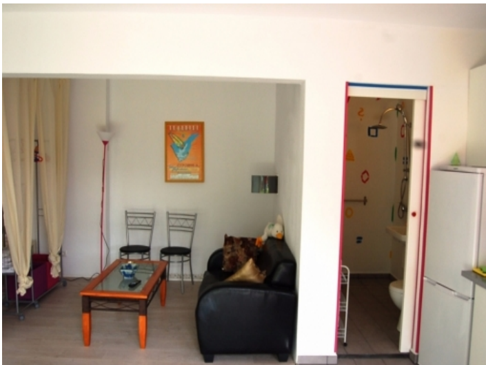
The cozy sitting area