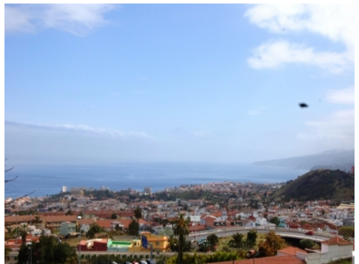
View of Puerto de la Cruz and the Coast