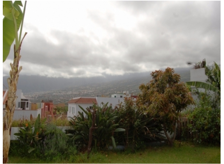
Views of the Orotava Valley