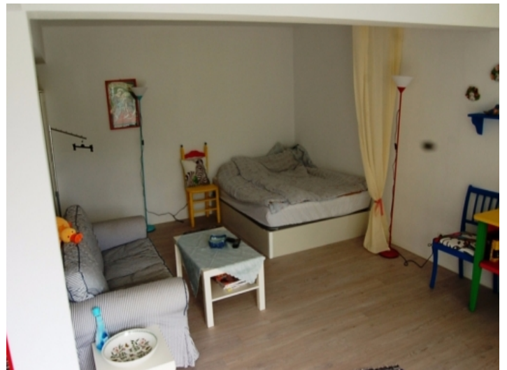
Sofa and double bed