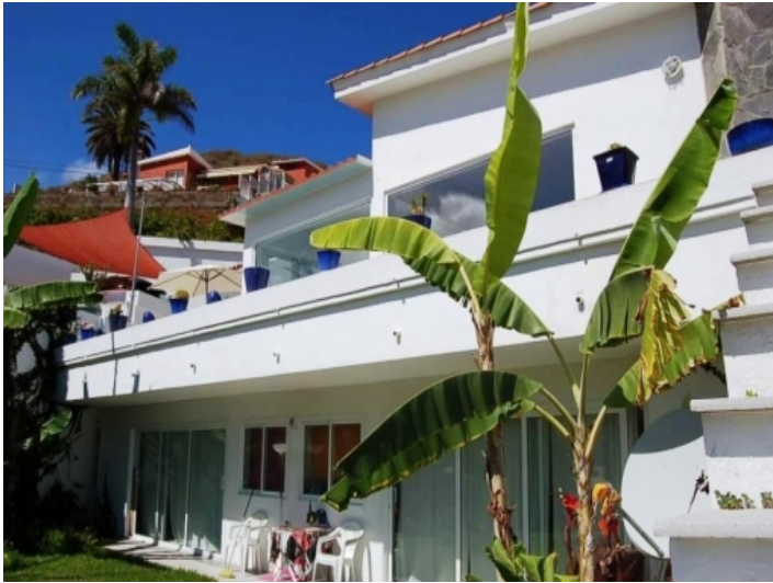
house, Puerto de la Cruz