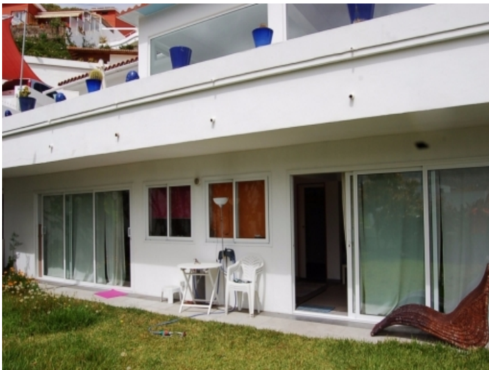
Exterior view of the apartment