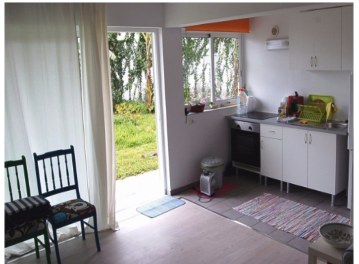
Kitchen and patio door to the garden