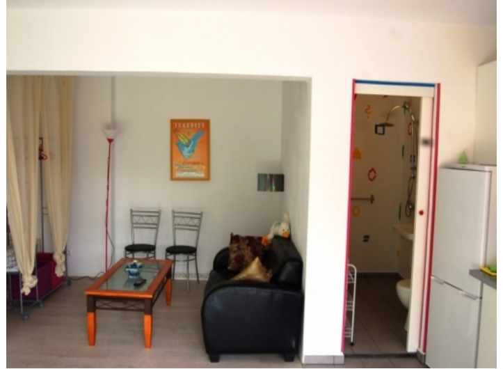
The cozy sitting area