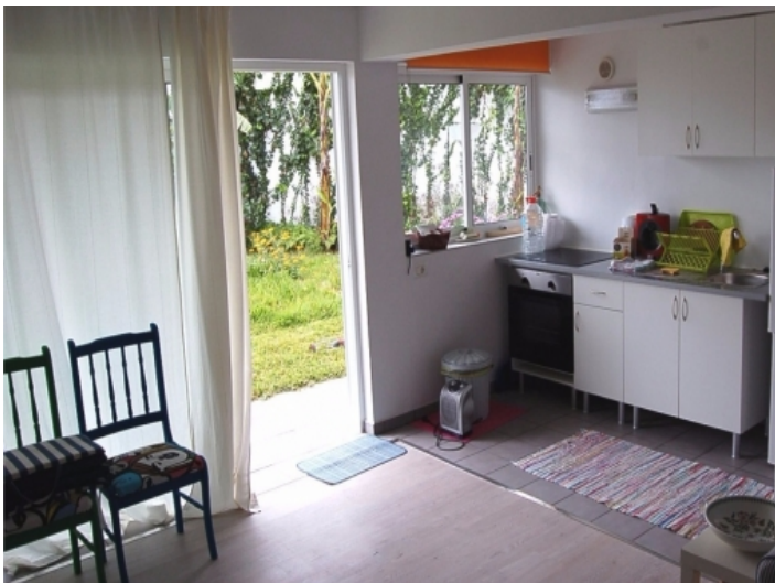
Kitchen and patio door to the garden