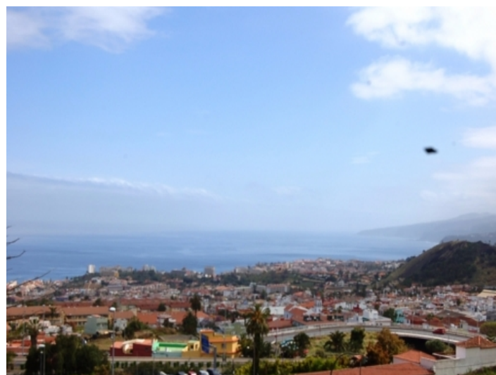
View of Puerto de la Cruz and the Coast