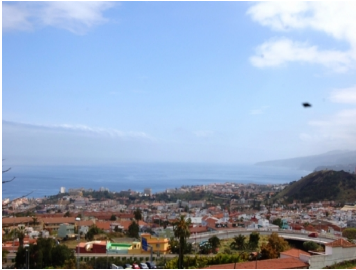
View of Puerto de la Cruz and the Coast