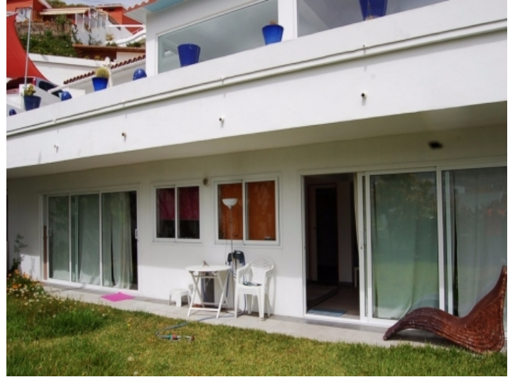
Exterior view of the apartment