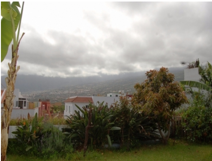
Views of the Orotava Valley