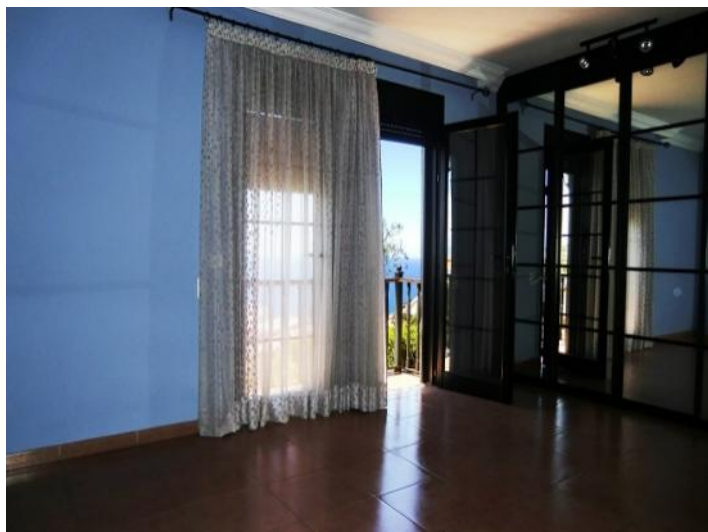
Bright room with access to the terrace