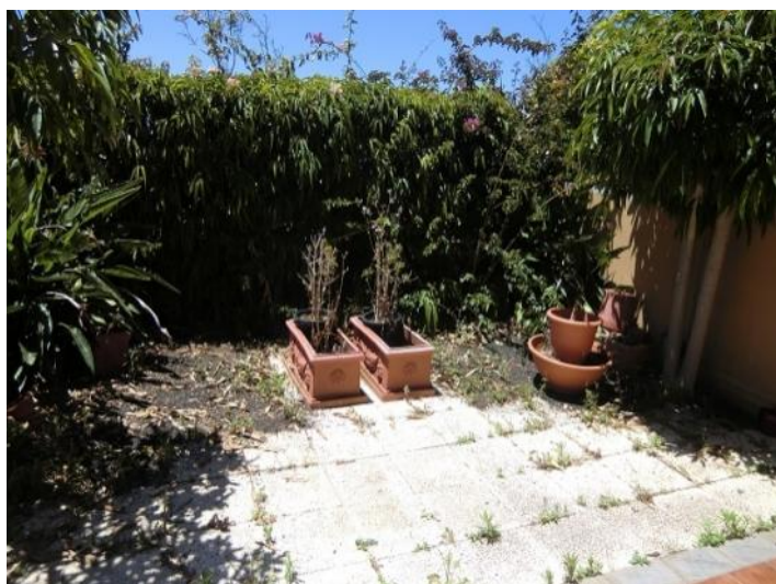
Terrace with garden