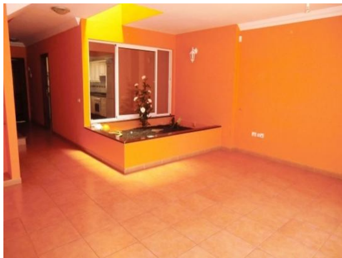
Spacious room with daylight