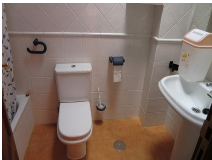
Bathroom with toilet and bathtub