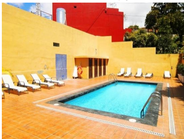
Pool with deck chairs