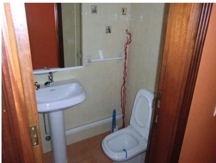
Bathroom with toilet