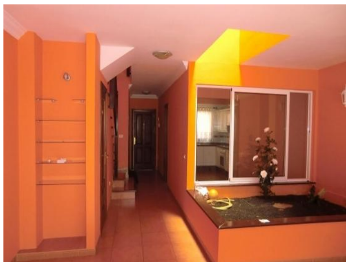
View through the hall to the kitchen and front door