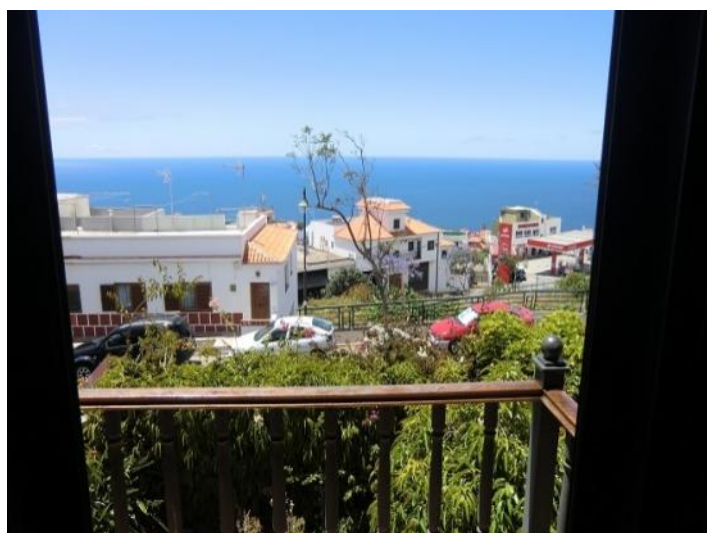
View of the Atlantic Ocean